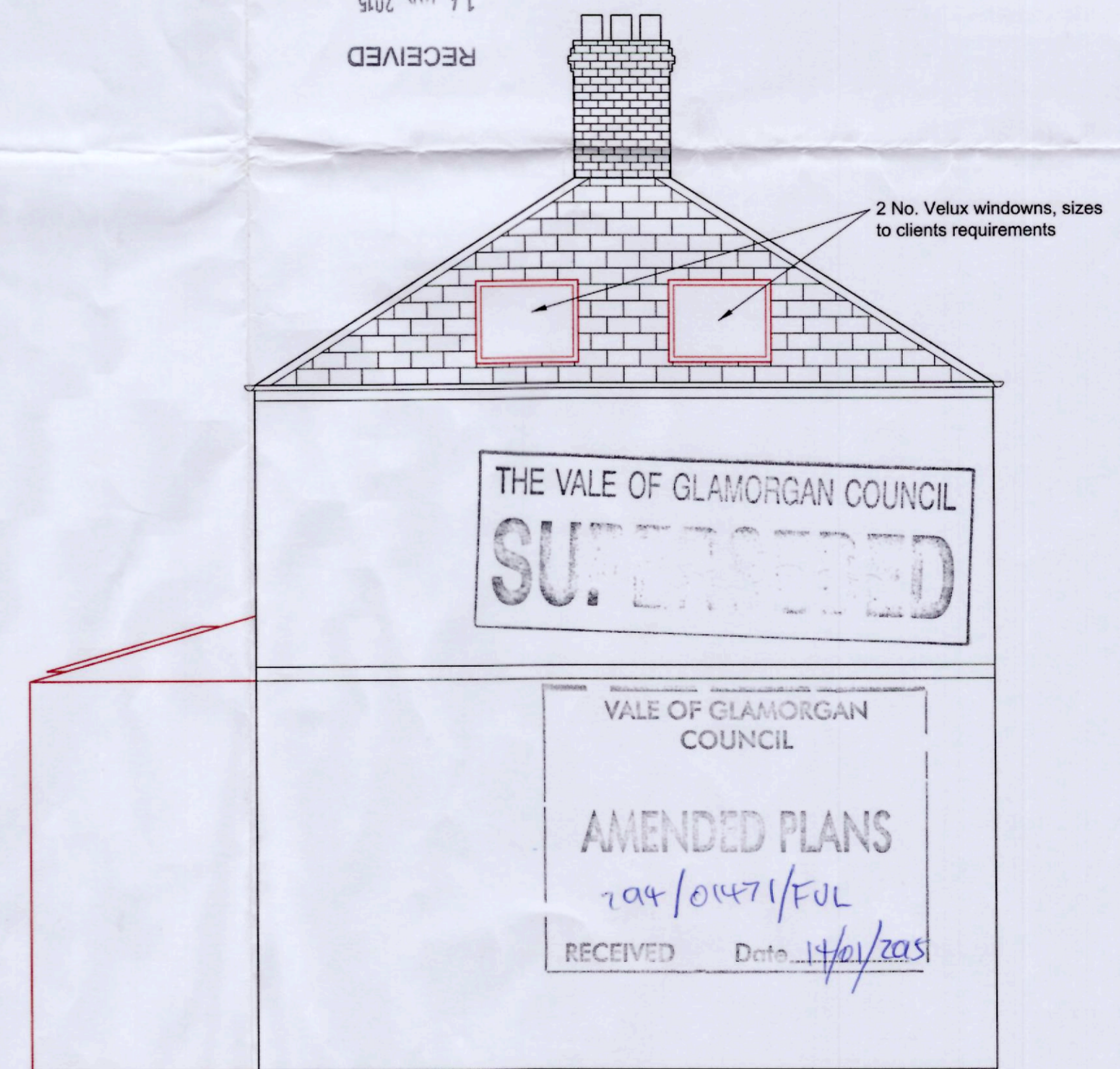
Proposed Side Elevation 1:50

BEFORE ANY WORK ON SITE IS STARTED TRIAL HOLES TO BE LOCATED AND AGREED BETWEEN BUILDER AND BUILDING CONTROL OFFICER TO DETERMINE THE GROUND CONDITIONS, TYPE OF FOUNDATIONS AND DEPTH OF FOUNDATIONS.