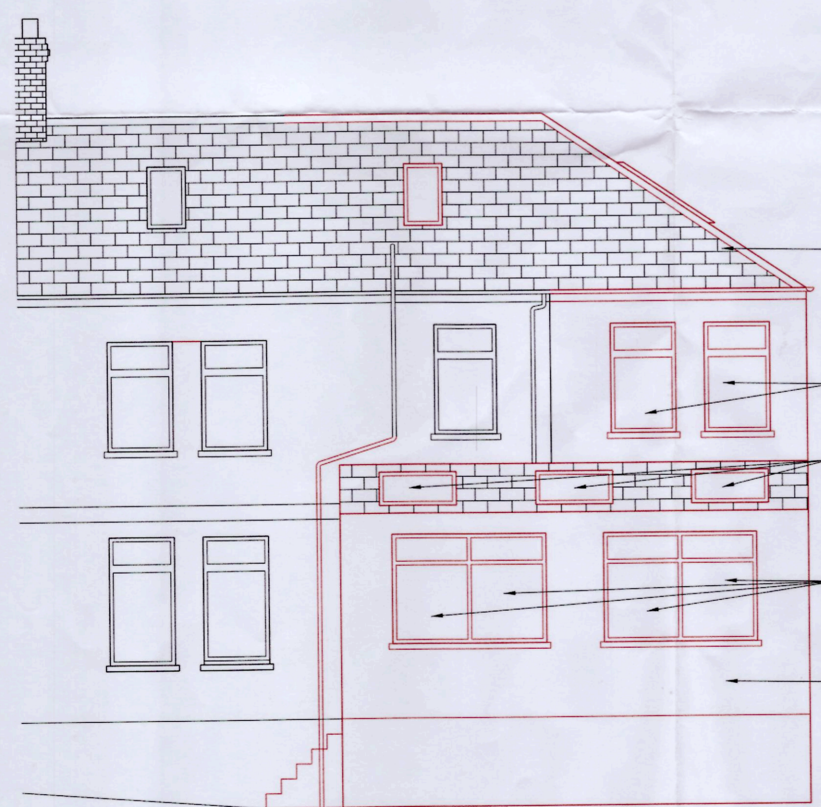
Proposed Rear Elevation 1:50