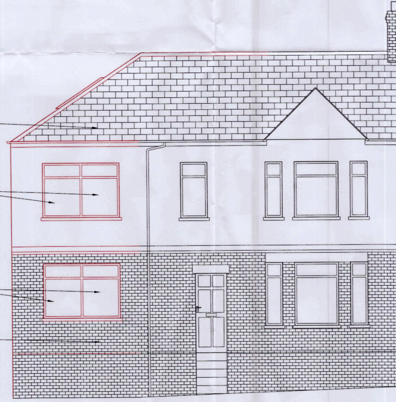
Proposed Front Elevation 1:50