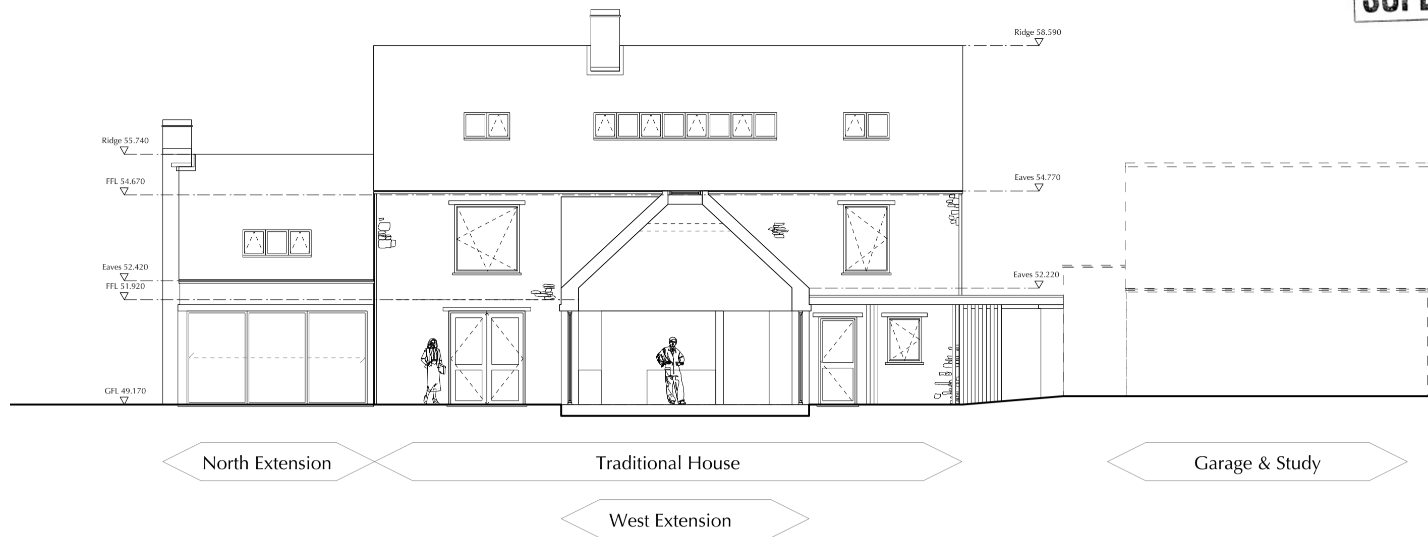
SECTION AA SCALE 1:100 @ A1, 1:200 @ A3

THE VALE OF GLAMORGAN COUNCIL SUPERSEDED