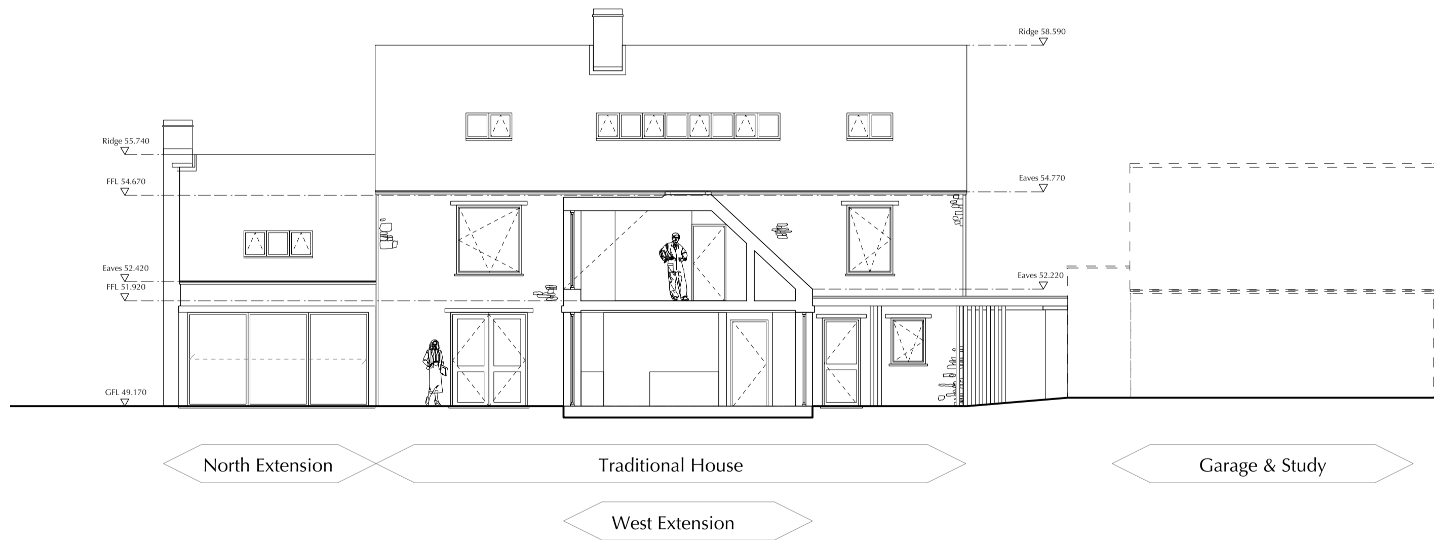
SECTION CC SCALE 1:100 @ A1, 1:200 @ A3