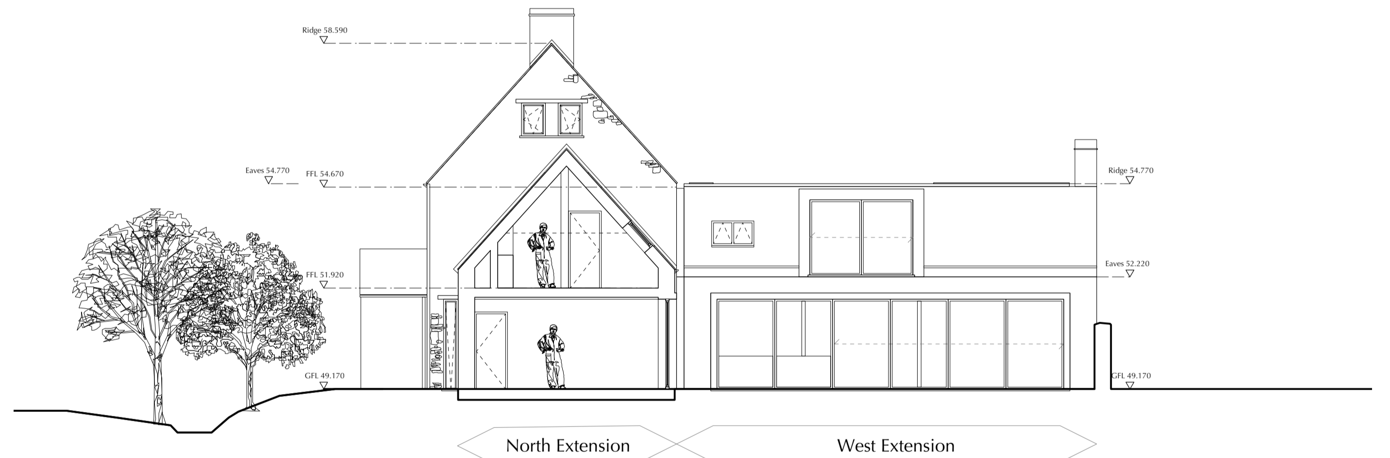
SECTION DD SCALE 1:100 @ A1, 1:200 @ A3