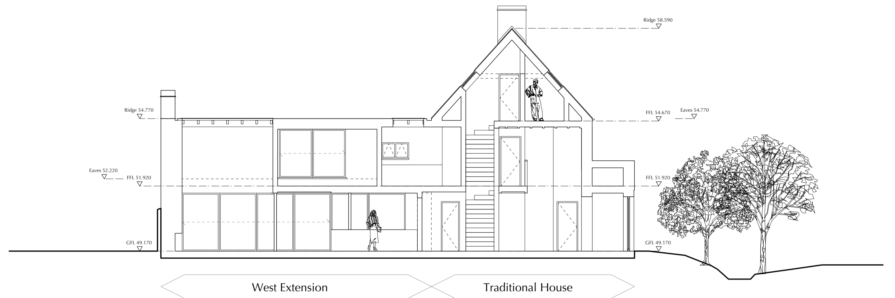
SECTION BB SCALE 1:100 @ A1, 1:200 @ A3