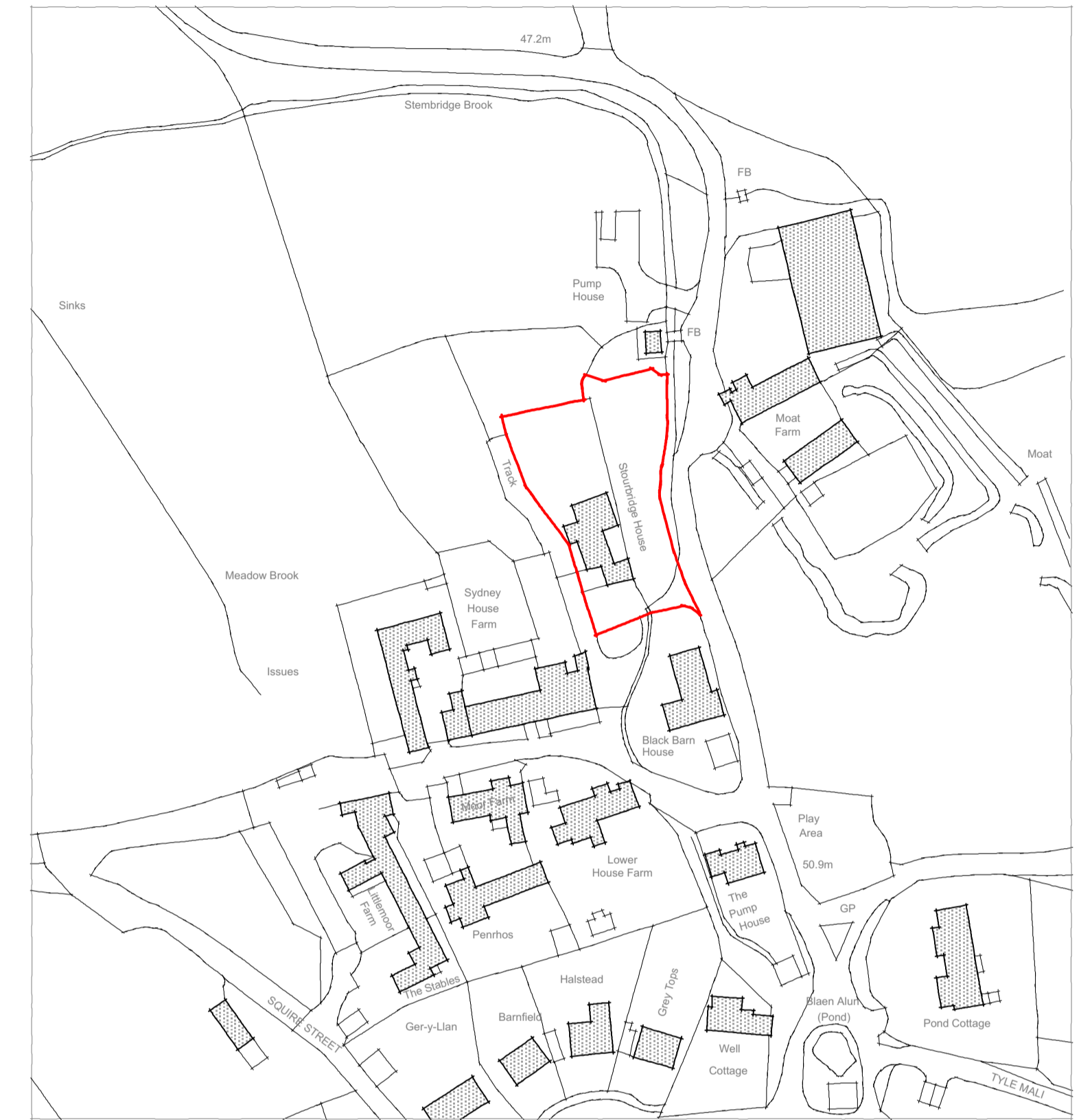
LOCATION PLAN SCALE 1:1250 @ A1, 1:2500 @ A3