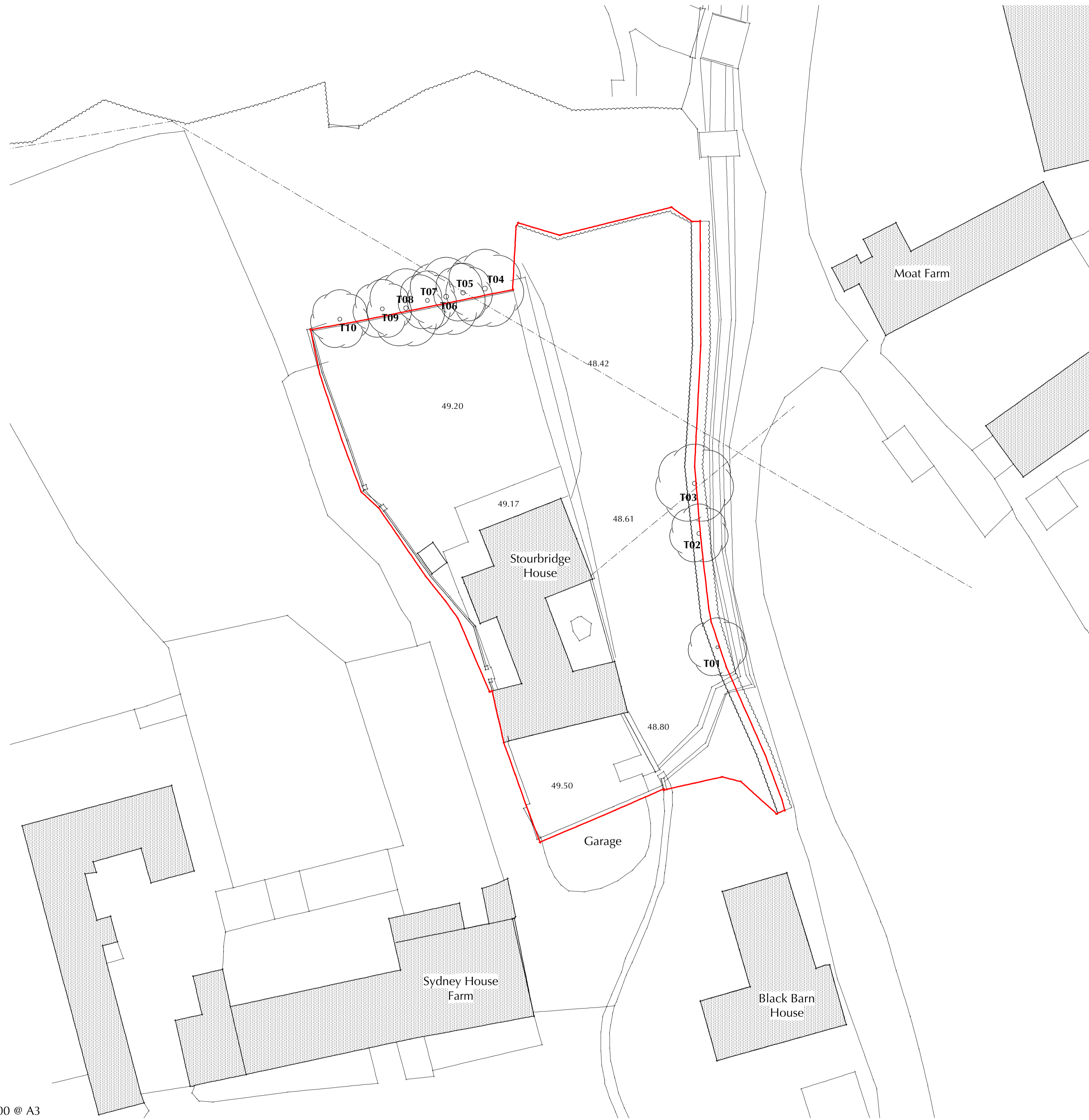
SITE PLAN SCALE 1:250 @ A1, 1:500 @ A3

THE VALE OF GLAMORGAN COUNCIL TOWN AND COUNTRY PLANNING ACT 1990 APPROVED SUBJECT TO COMPLIANCE WITH CONDITIONS (IF ANY)