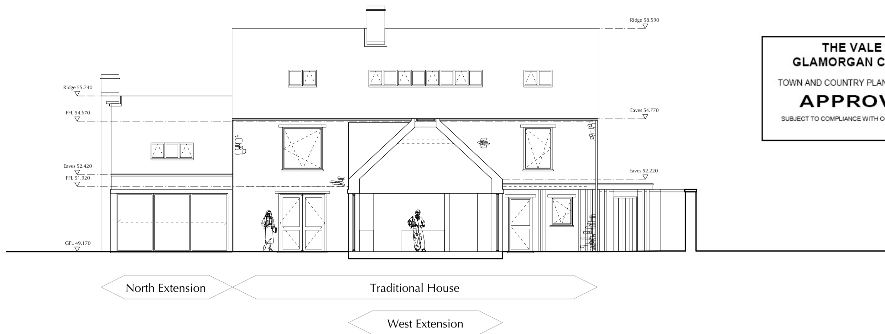
SECTION AA SCALE 1:100 @ A1, 1:200 @ A3

THE VALE OF GLAMORGAN COUNCIL TOWN AND COUNTRY PLANNING ACT 1990 APPROVED SUBJECT TO COMPLIANCE WITH CONDITIONS (IF ANY)