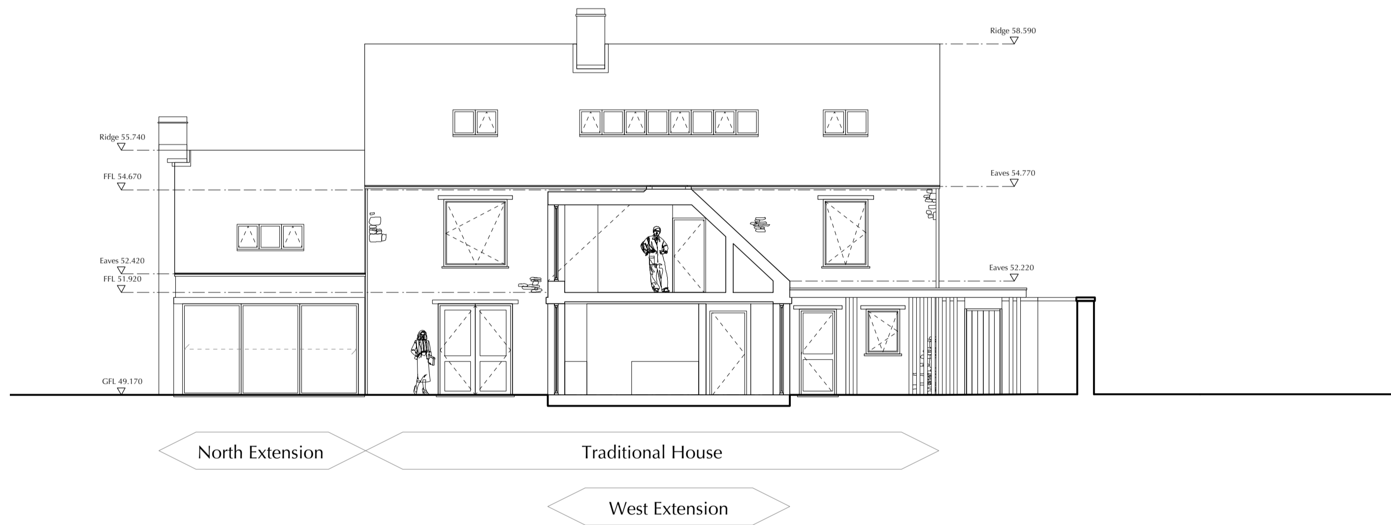
SECTION CC SCALE 1:100 @ A1, 1:200 @ A3