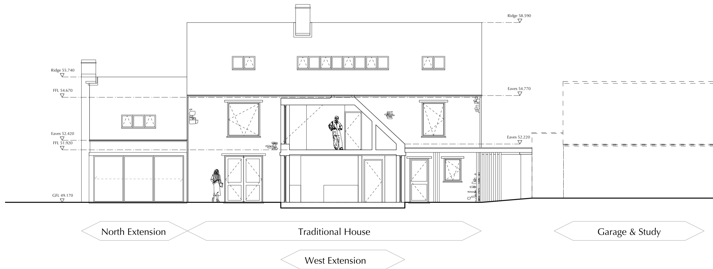
SECTION CC SCALE 1:100 @ A1, 1:200 @ A3