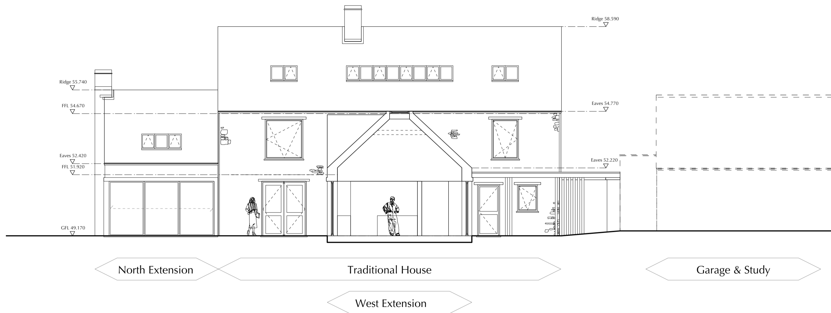
SECTION AA SCALE 1:100 @ A1, 1:200 @ A3

THE VALE OF GLAMORGAN COUNCIL SUPERSEDED