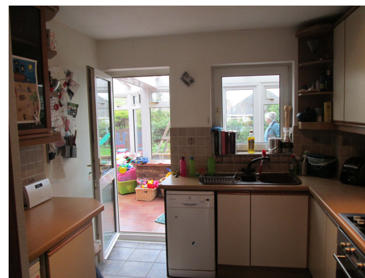
Existing Kitchen Photograph