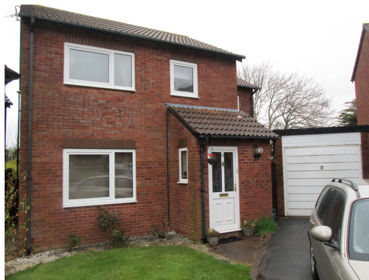
Existing Front Photograph