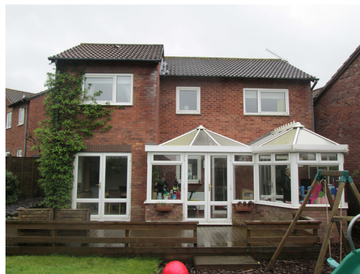
Existing Rear Photograph