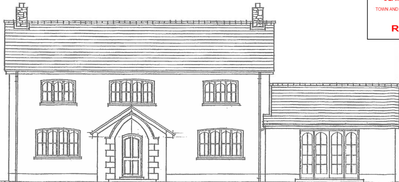
existing front elevation

THE VALE OF GLAMORGAN COUNCIL TOWN AND COUNTRY PLANNING ACT 1990 REFUSED