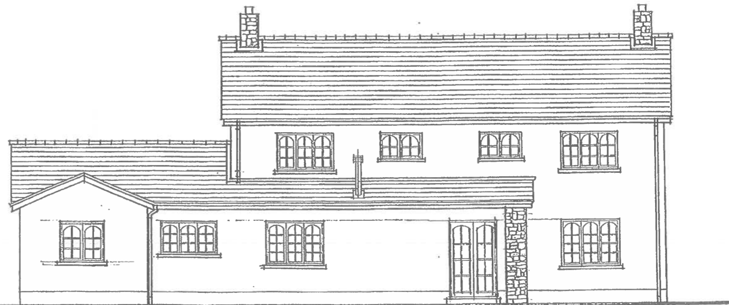
existing rear elevation

RECEIVED 05 NOV 2014 ENVIRONMENTAL AND ECONOMIC REGENERATION