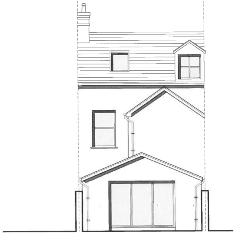
As built rear elevation