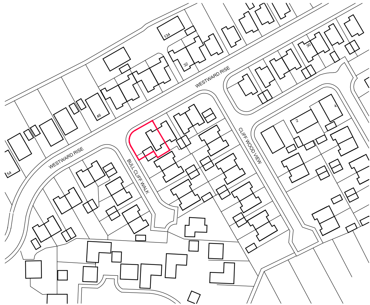
Red Line Location Plan @ 1:1250

THE VALE OF GLAMORGAN COUNCIL TOWN AND COUNTRY PLANNING ACT 1990 APPROVED SUBJECT TO COMPLIANCE WITH CONDITIONS (IF ANY)