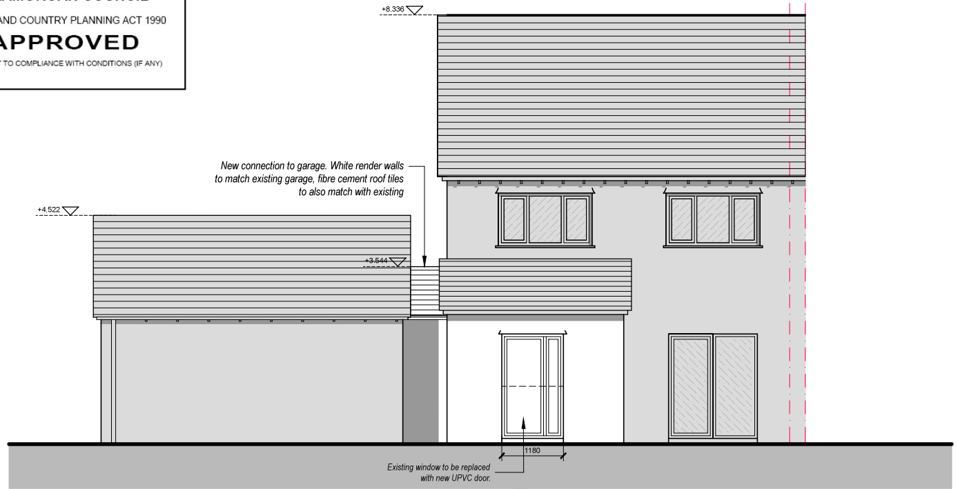
Proposed North-East (Rear) Elevation