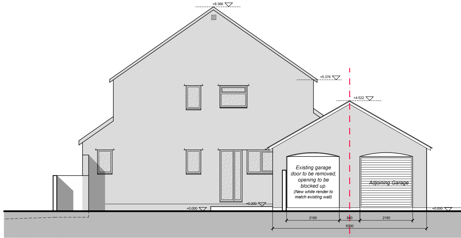
Proposed South-East (Side) Elevation