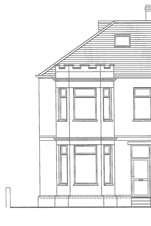
proposed front elevation