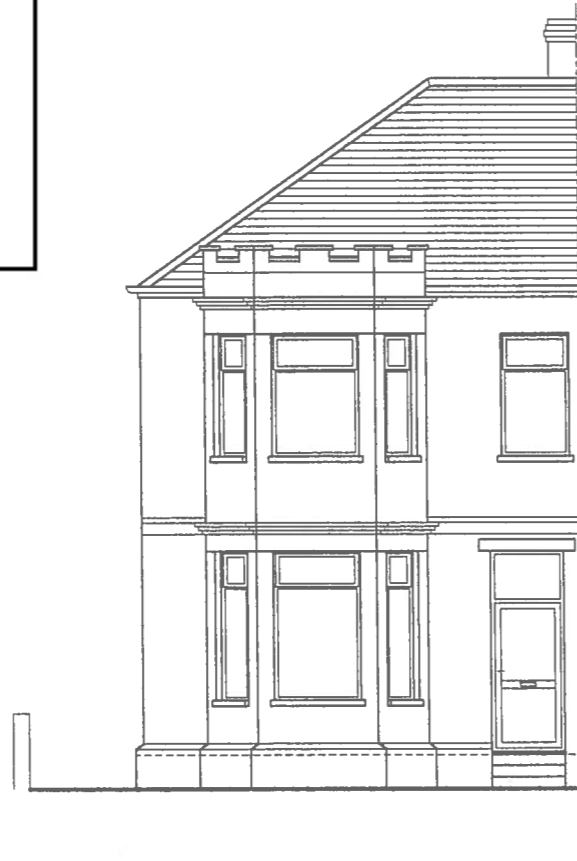
existing front elevation

SUBJECT TO COMPLIANCE WITH CONDITIONS (IF ANY)