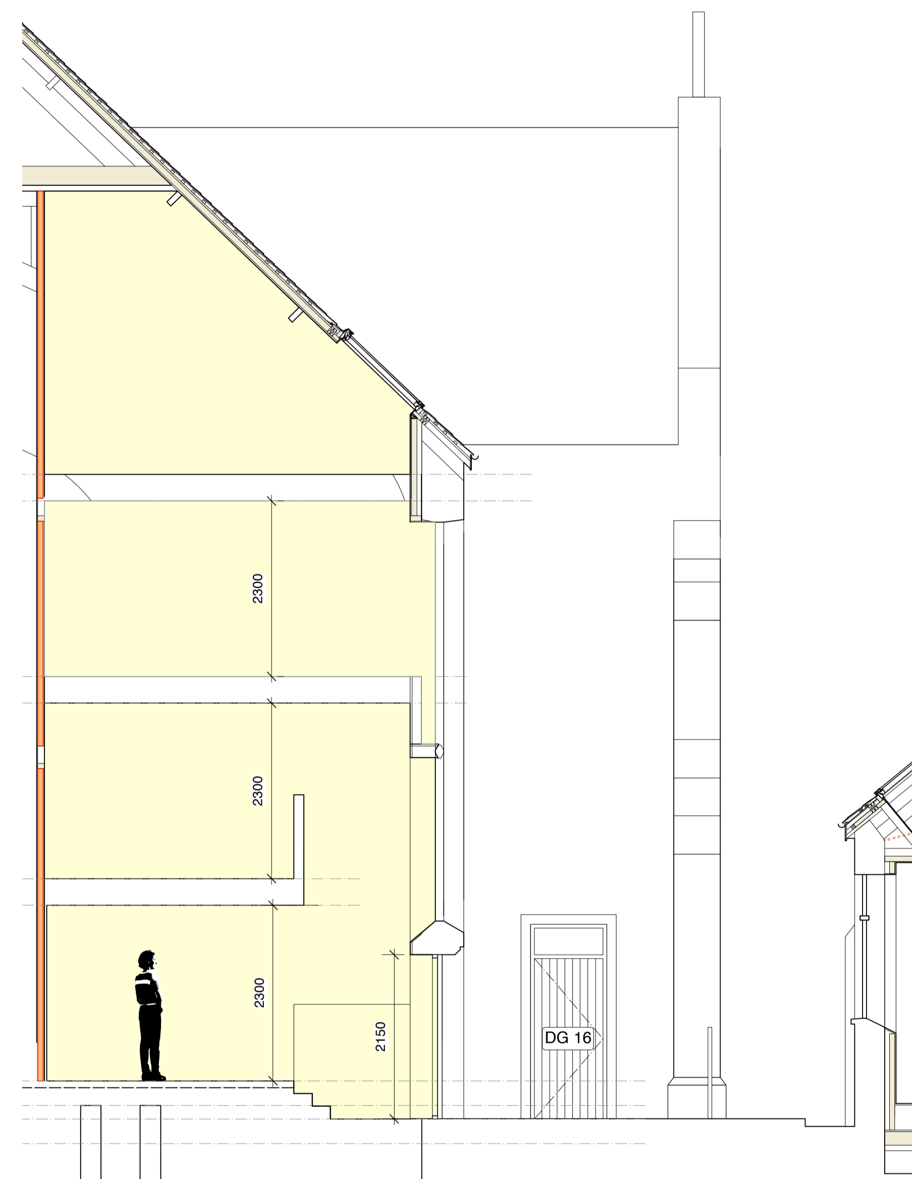
Section through 4B

LOWERED GROUND FLOOR SECTION / NEW DOORS