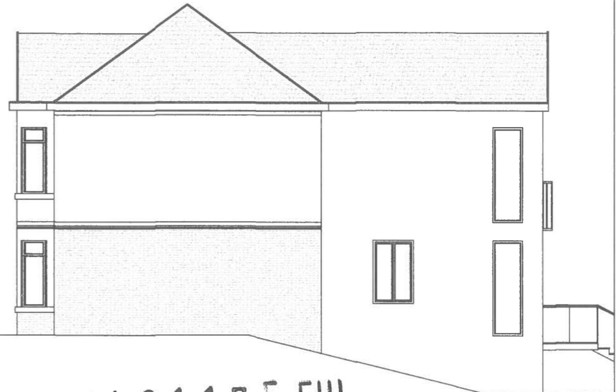
Right side elevation