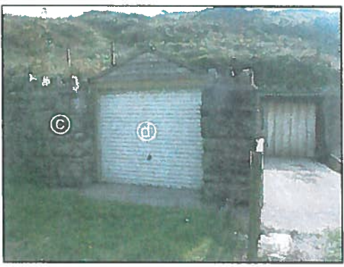
Remove wall section c) Demolish garage building d) Remove all materials from site