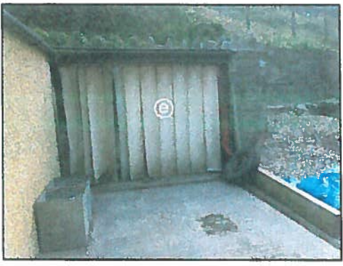
Demolish machinery store e) Remove all materials from site