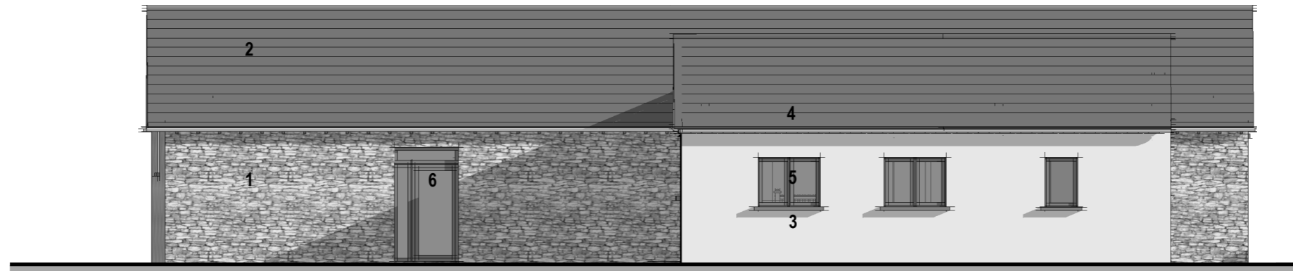
Rear (north) Elevation