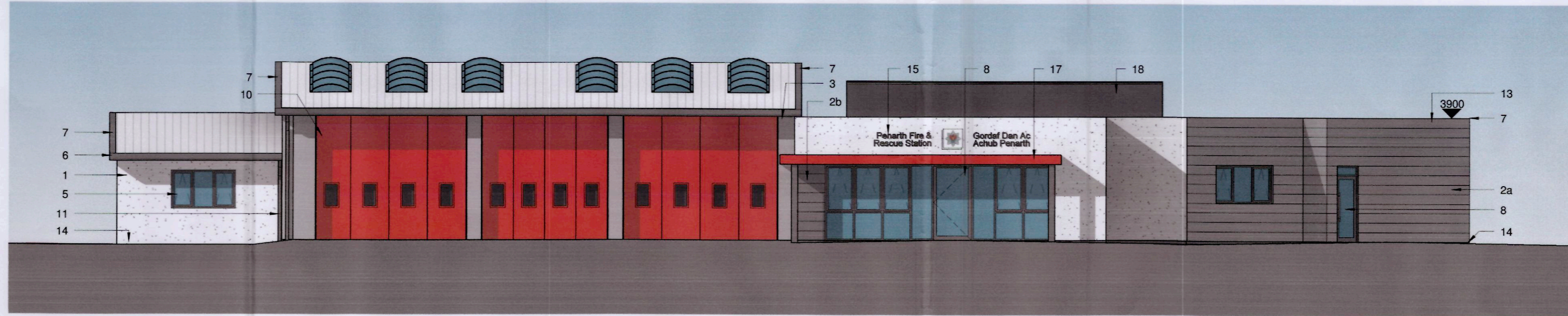
Proposed North Elevation 1 : 100