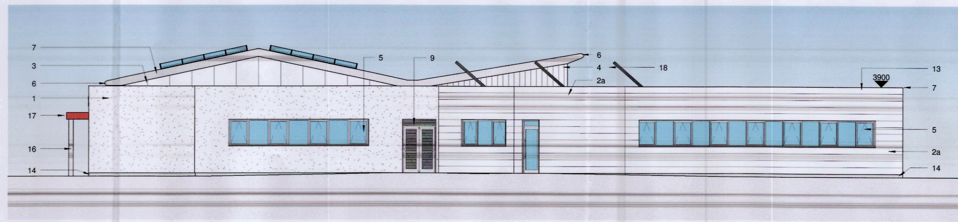
Proposed West Elevation 1 : 100

THE VALE OF GLAMORGAN COUNCIL TOWN AND COUNTRY PLANNING ACT 1990 APPROVED SUBJECT TO COMPLIANCE WITH CONDITIONS (IF ANY)