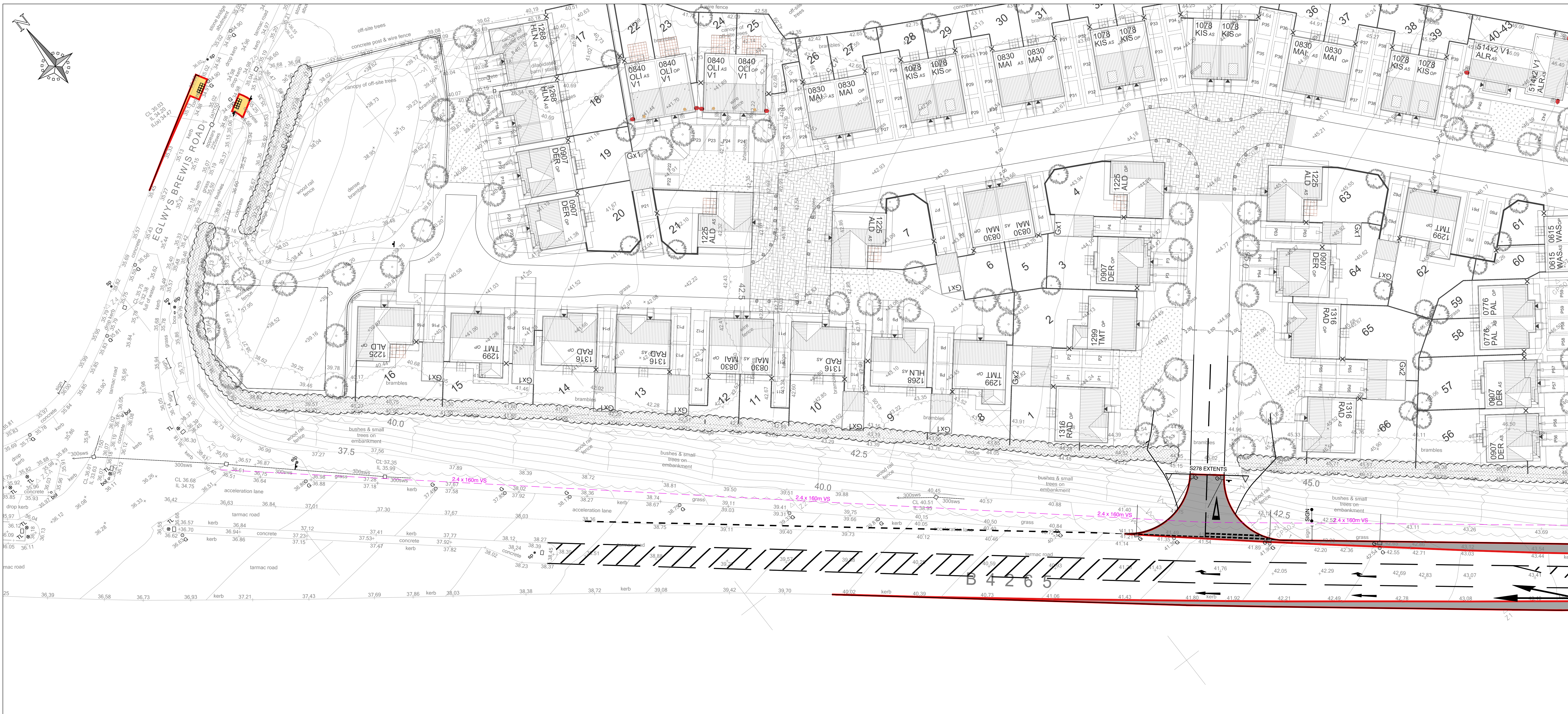
S278 GA - NORTH-WEST SECTION OF SITE SCALE 1:250