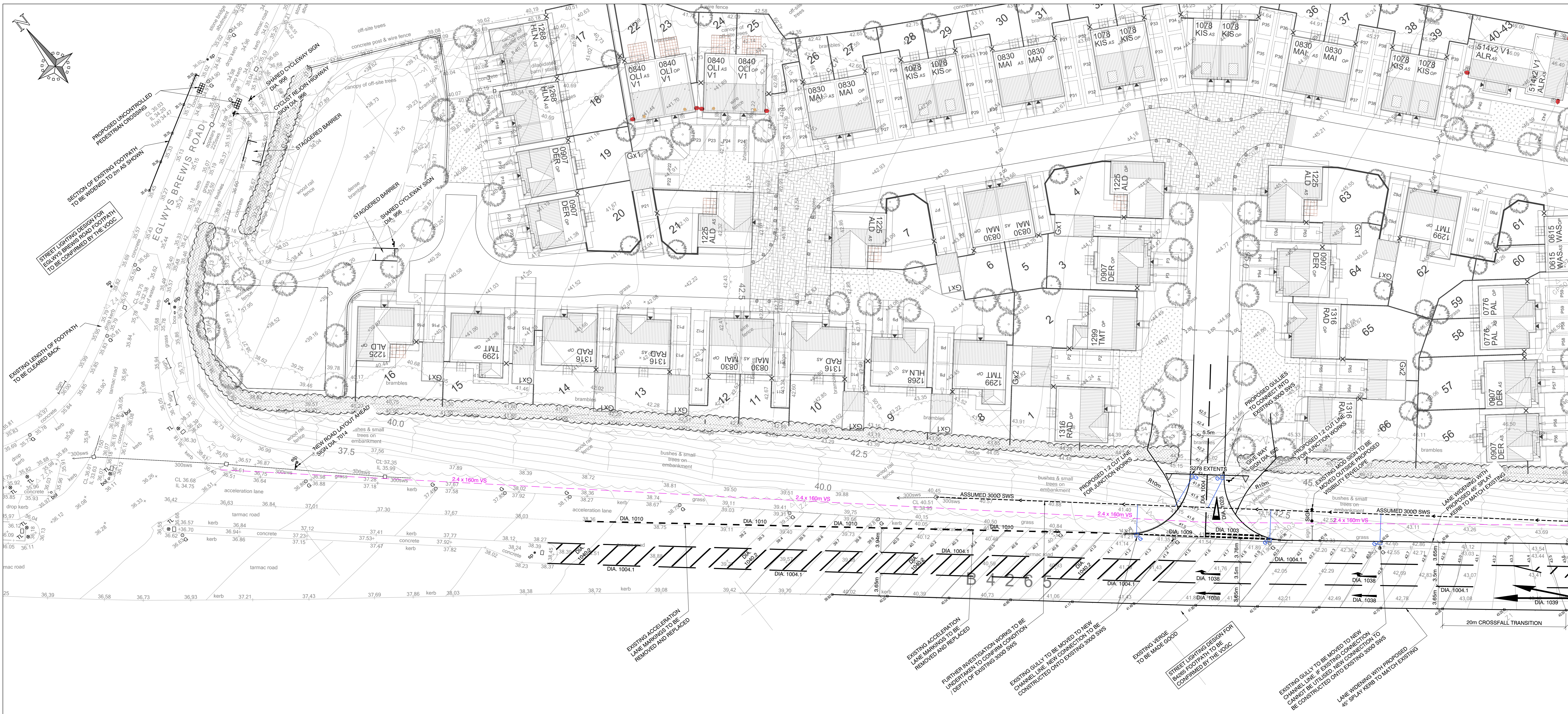
S278 GA - NORTH-WEST SECTION OF SITE SCALE 1:250