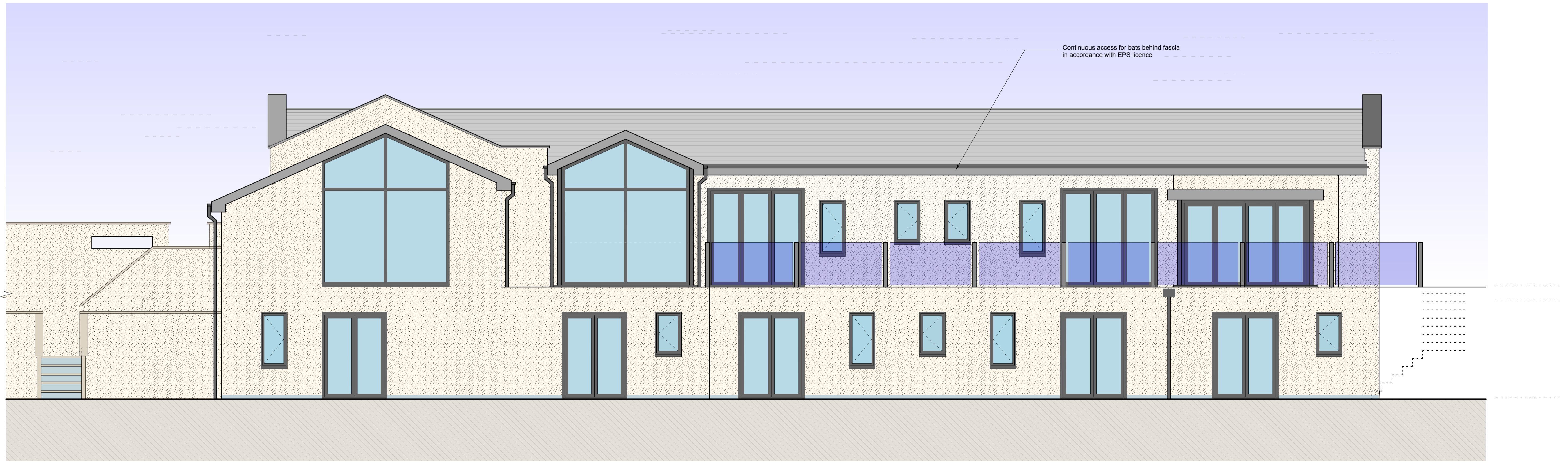
REAR ELEVATION facing south (scale 1 to 50 at A1)

Do not scale, use figured dimensions only. Dimensions to be checked on site and any discrepancies reported to the Architect immediately. This drawing is copyright.