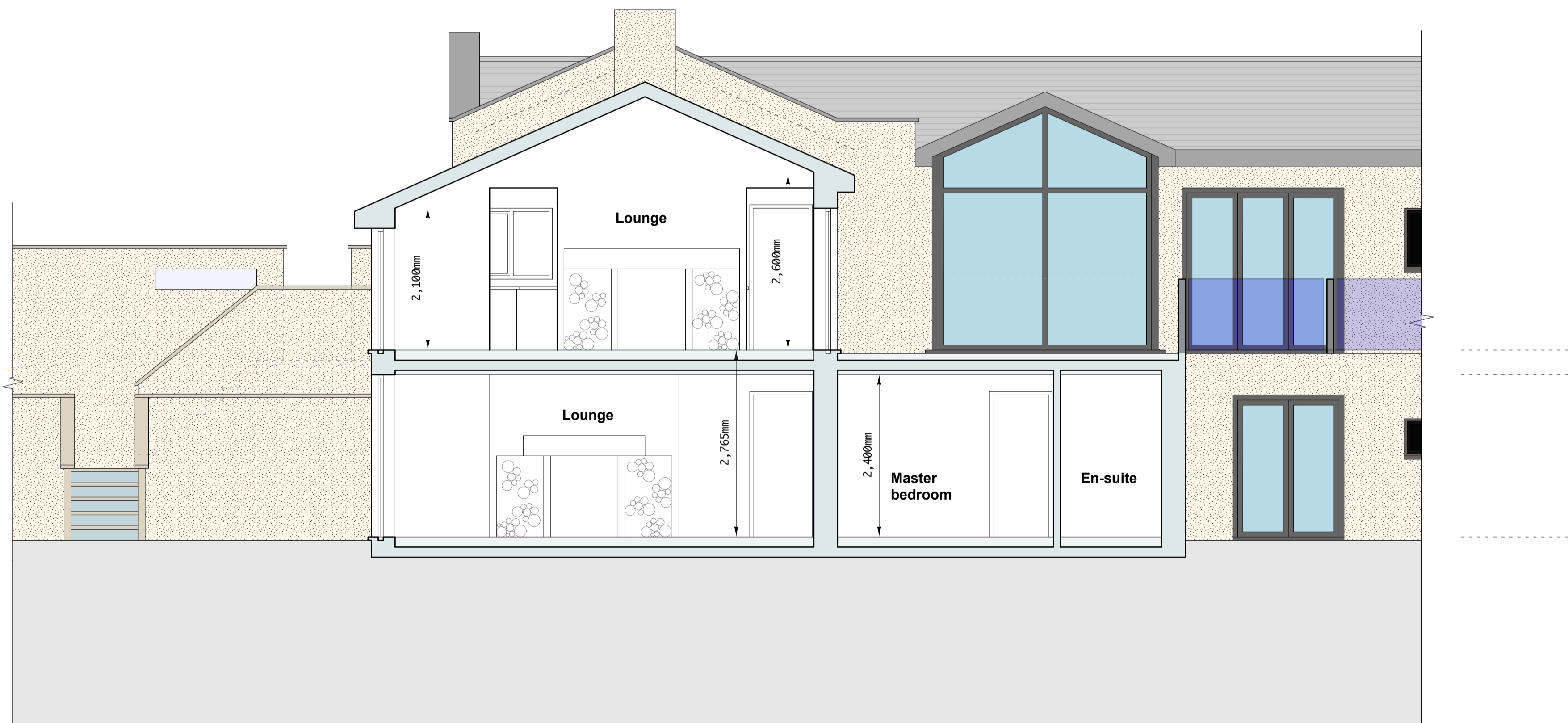
SECTION - FF