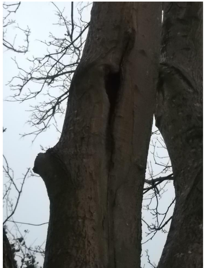
Figure 11 – Norway Maple with bat roost potential.