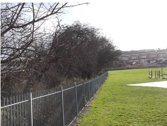
Figure 6 – Eastern boundary, looking south.