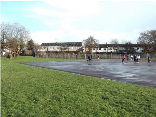
Figure 2 – Main site looking east, showing amenity grassland and hard standing school playground.