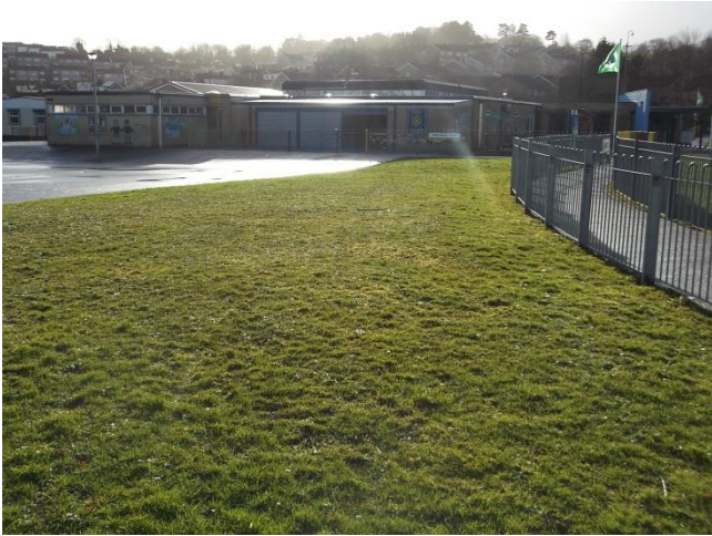
Figure 8 – western boundary, looking south.