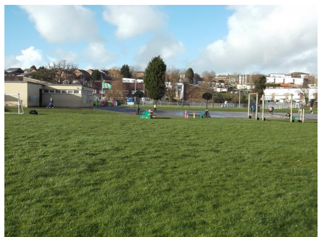
Figure 7 – Southern boundary (this cuts across existing amenity grassland and school playground, looking west.