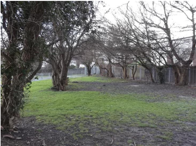
Figure 4 – North eastern boundary, looking west, showing tree and scrub habitat.