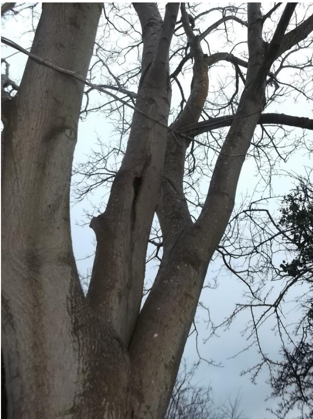
Figure 10 – Norway Maple with bat roost potential.