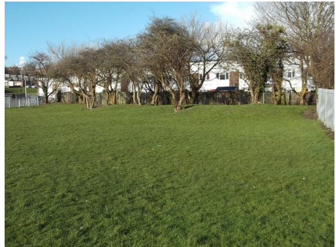
Figure 5 – North eastern boundary, looking north, showing tree and scrub habitat.