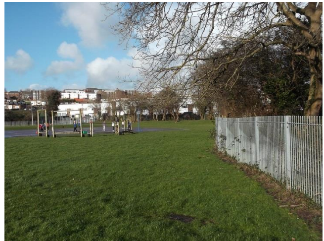
Figure 3 – Main site looking north, showing amenity grassland and hard standing school playground and part of the eastern boundary.