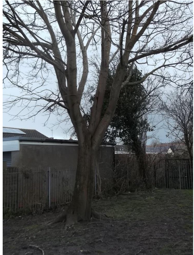
Figure 9 – Norway Maple with bat roost potential.