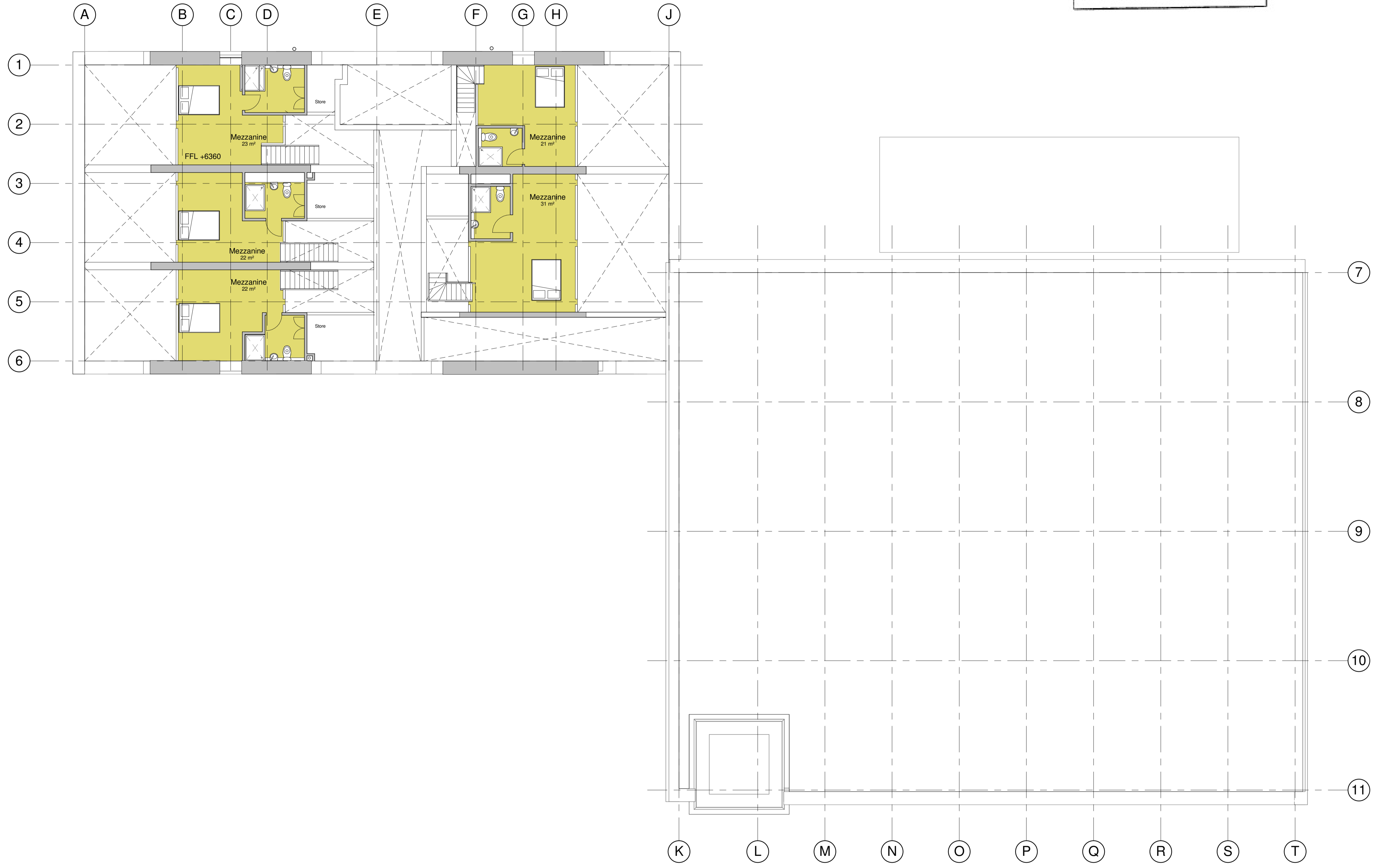
1 4 South Range Mezzanine 1 : 100

Notes Copyright: All rights reserved. This drawing must not be reproduced without permission. This drawing must not be scaled. Dimensions are in millimetres unless specified.