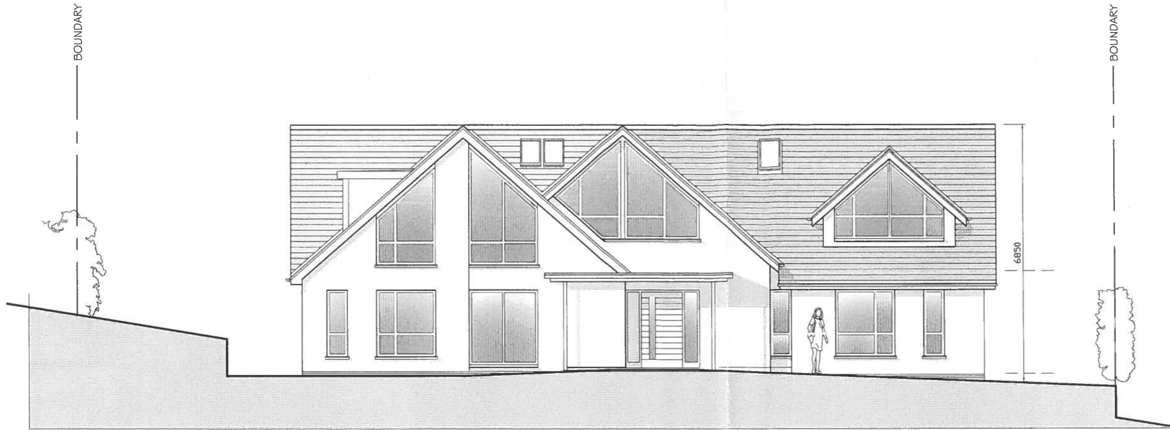
FRONT (East) ELEVATION AS PROPOSED

THE VALE OF GLAMORGAN COUNCIL TOWN AND COUNTRY PLANNING ACT 1990 APPROVED SUBJECT TO COMPLIANCE WITH CONDITIONS (IF ANY)