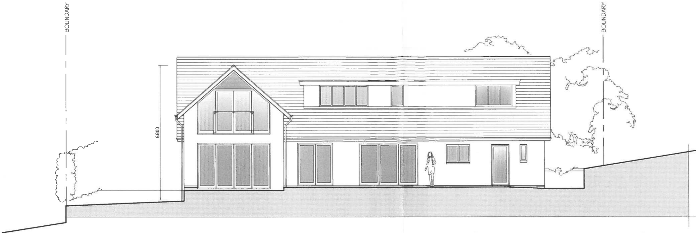
REAR (West) ELEVATION AS PROPOSED

THE VALE OF GLAMORGAN COUNCIL TOWN AND COUNTRY PLANNING ACT 1990 APPROVED SUBJECT TO COMPLIANCE WITH CONDITIONS (IF ANY)