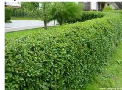
Ligustrum ovalifolium (Privet)