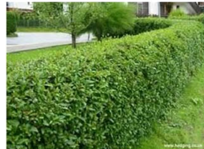
Ligustrum ovalifolium (Privet)