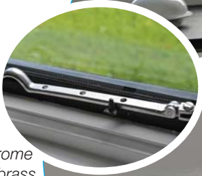
Satin chrome finished brass peg stay