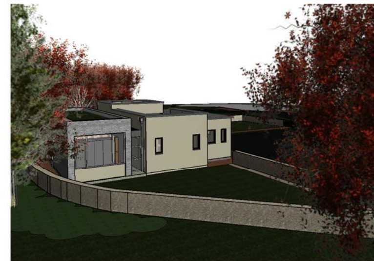
5 West Elevation #1