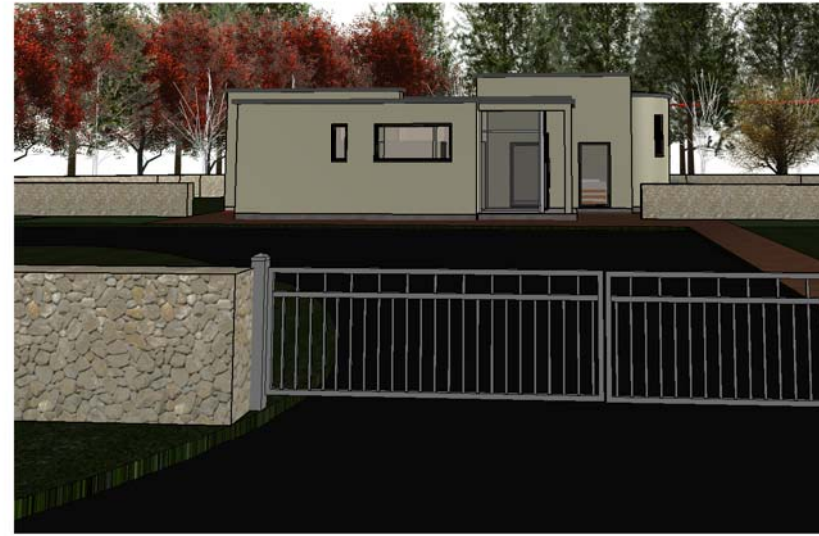
4 View from Road