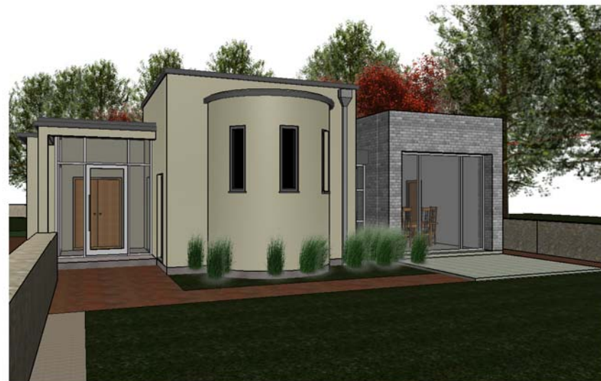
2 East Elevation #2