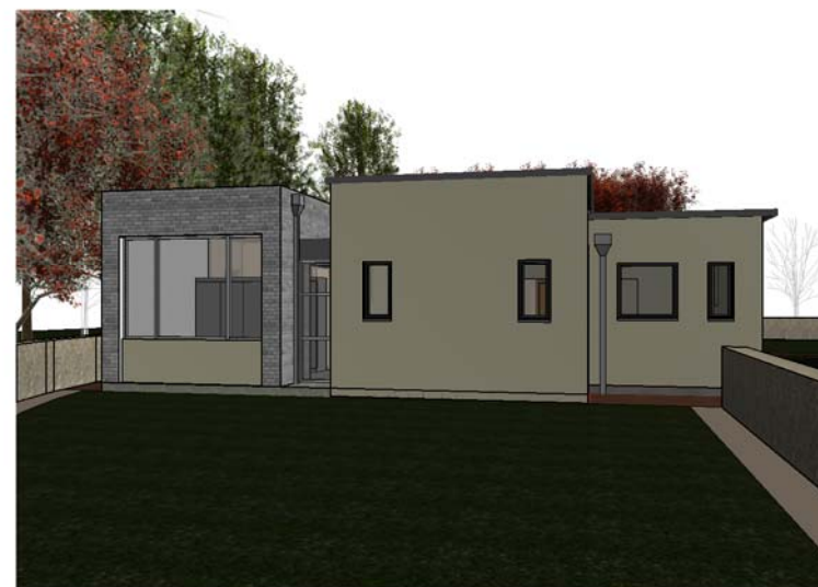
6 West Elevation #2

THE VALE OF GLAMORGAN COUNCIL TOWN AND COUNTRY PLANNING ACT 1990 APPROVED SUBJECT TO COMPLIANCE WITH CONDITIONS (IF ANY)