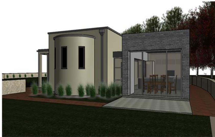
1 East Elevation #1