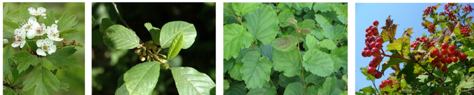
Crataegus monogyna Rhamnus frangula Corylus avellana Viburnum opulus