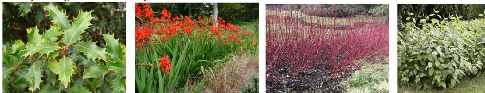
Ilex aquifolium Crocsmia 'Lucifer' Cornus alba 'Sibirica' Cornus alba 'Sibirica' - in leaf