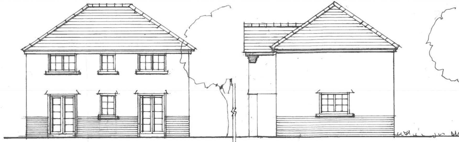
WEST (REAR) ELEVATION