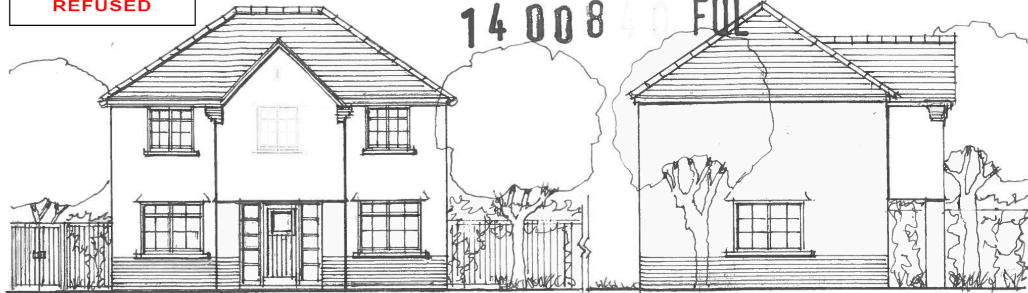
EAST (FRONT) ELEVATION