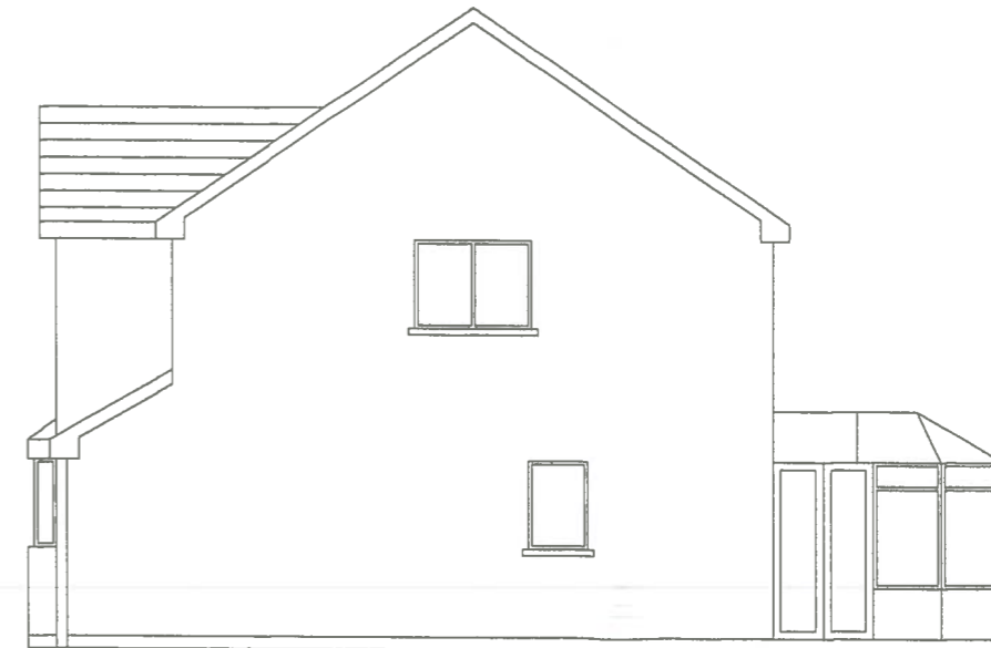
Existing side elevation