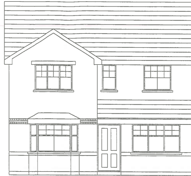
Existing front elevation