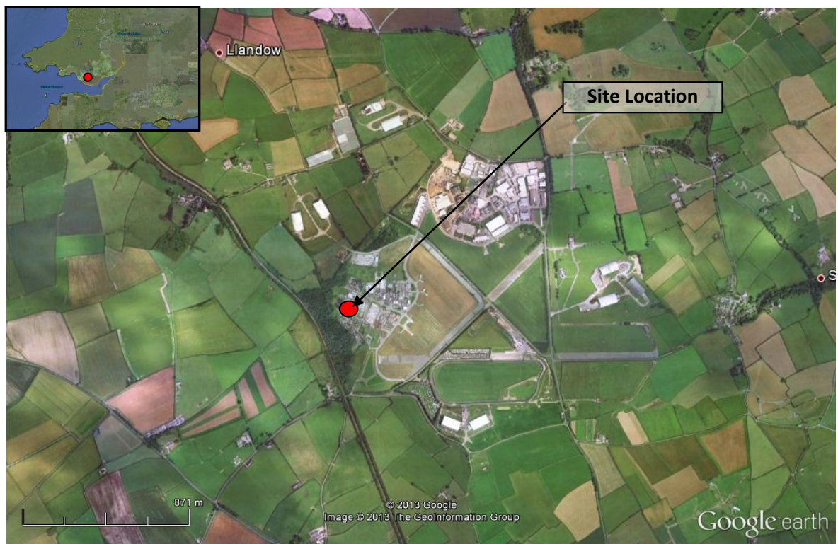
Figure 1: Location of site