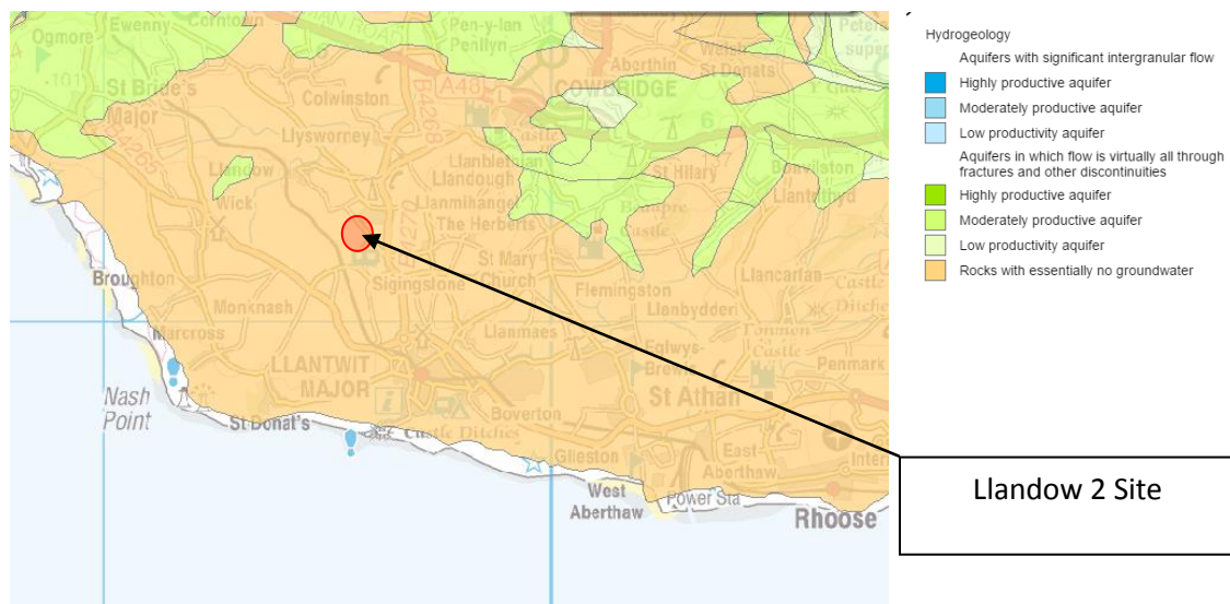
Figure 5: Map taken from the BGS, stating that the Jurassic Limestone has very little groundwater