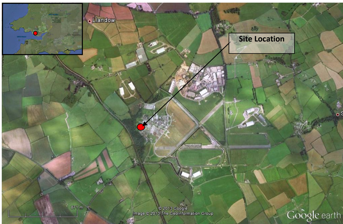
Figure 1: Location of site