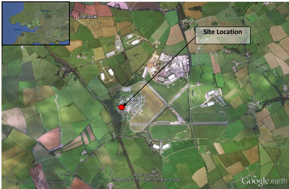
Figure 1: Location of site