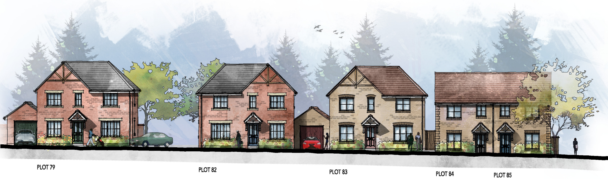
STREET SCENE 1