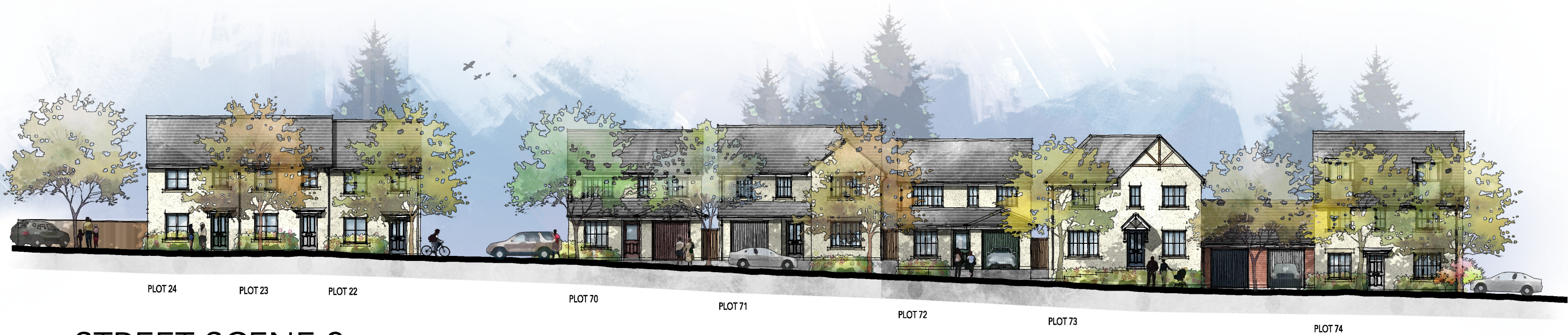
STREET SCENE 2