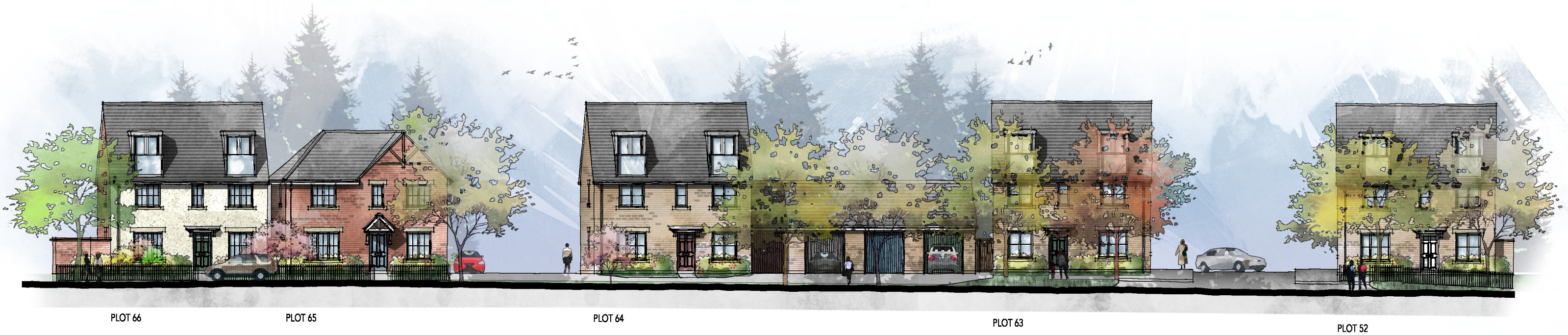
STREET SCENE 3