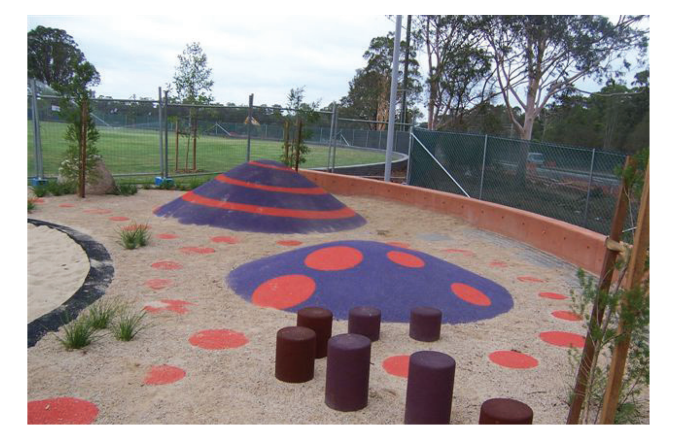
3 Approx. height 1200mm