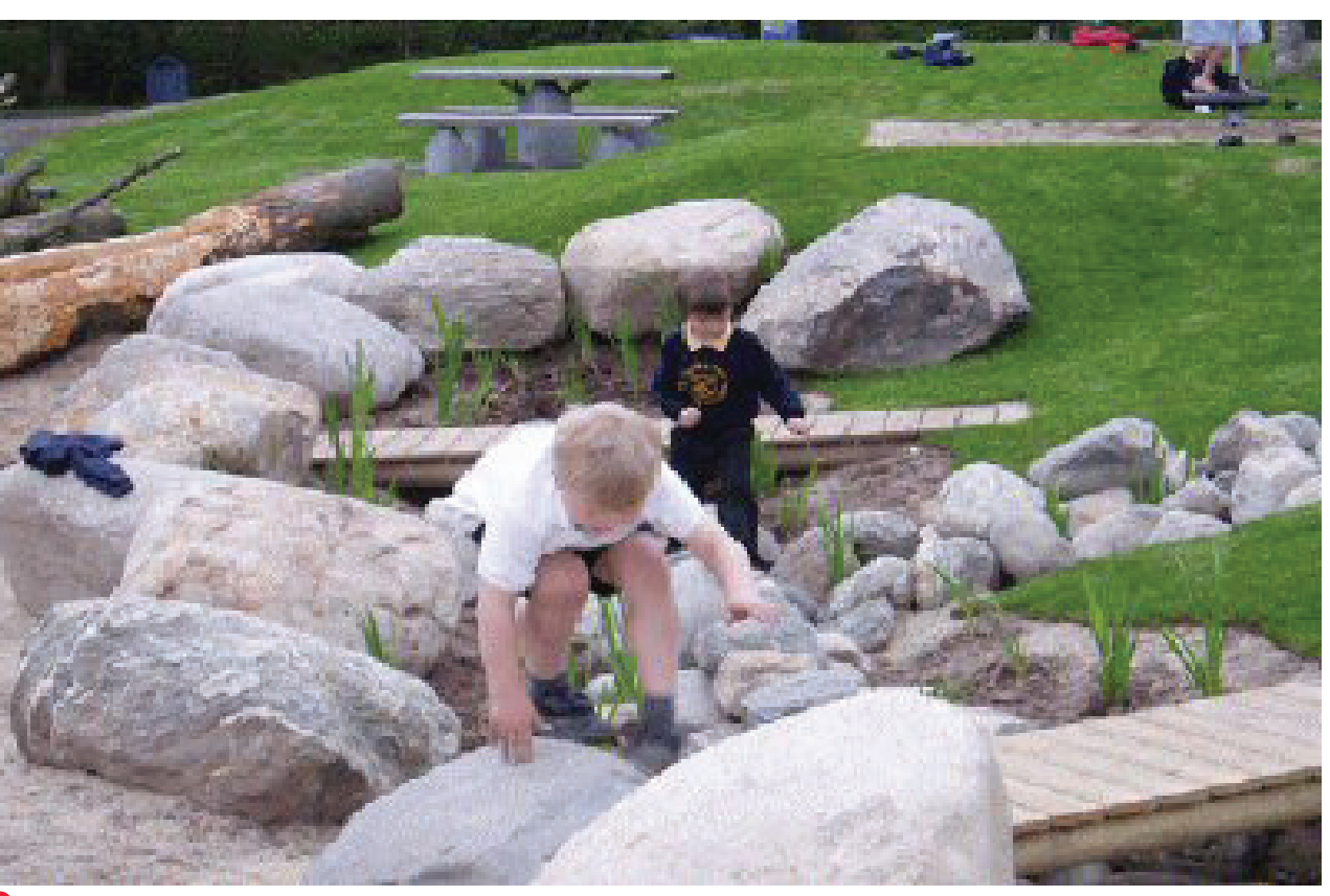
2 Approx. height 900mm