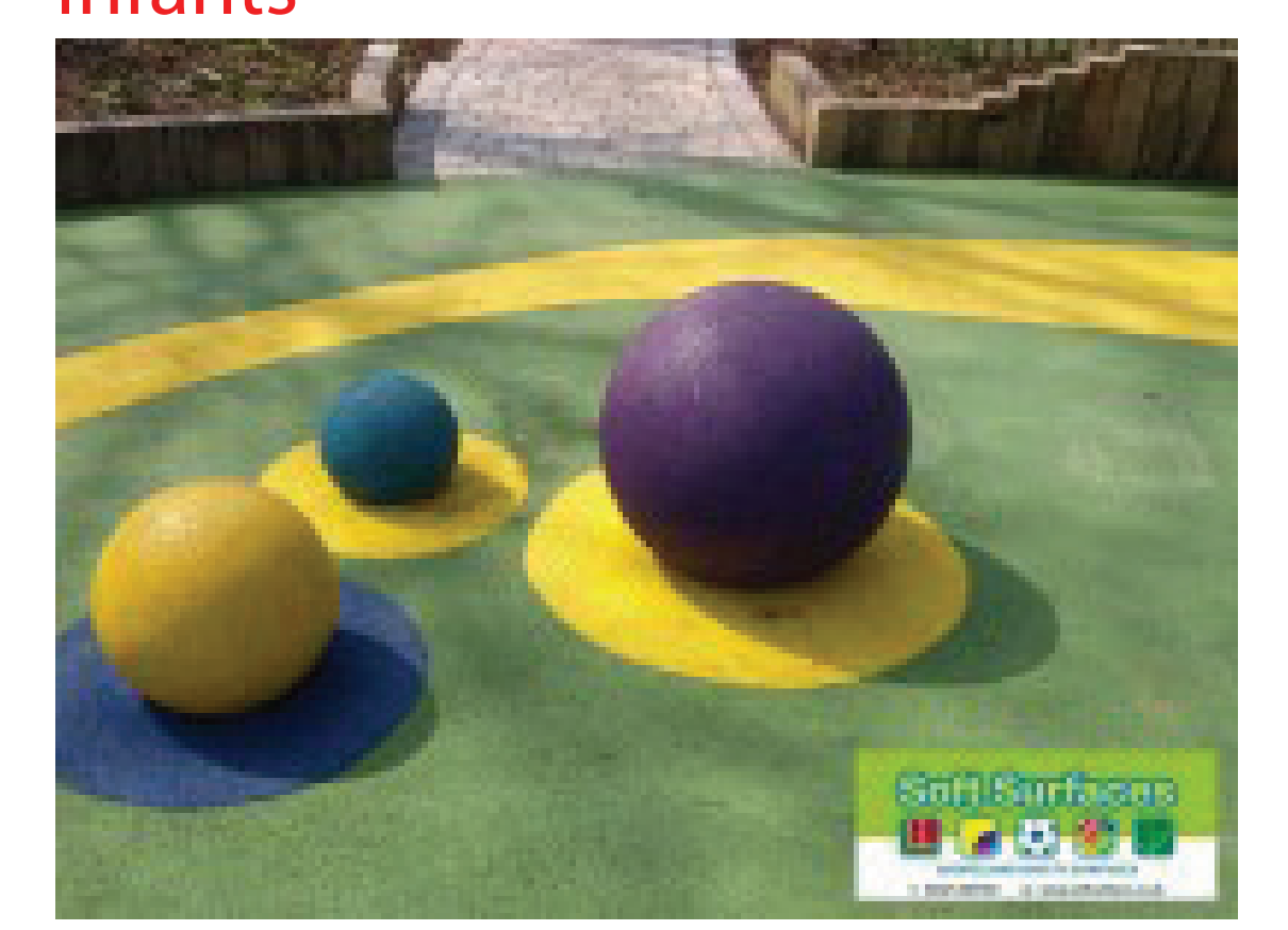
1 Approx. height 200mm - 500mm