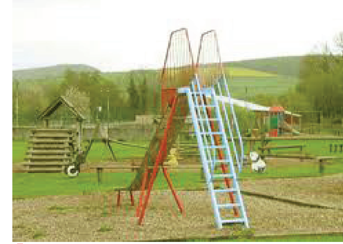
5 Approx. height 3000mm (max)