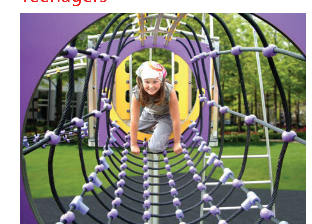
4 Approx. height 2500mm (max)

SUBJECT TO COMPLIANCE WITH CONDITIONS (IF ANY)