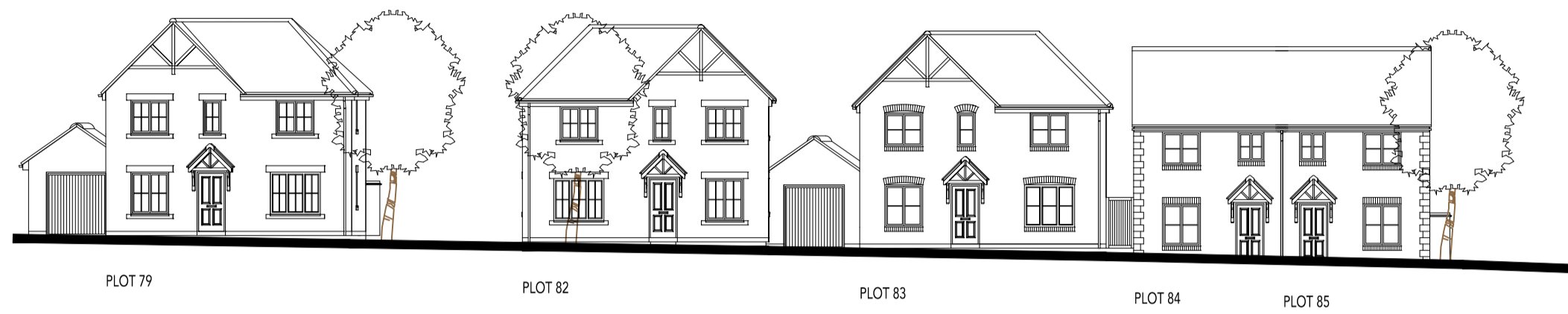
STREET SCENE 1

THE VALE OF GLAMORGAN COUNCIL TOWN AND COUNTRY PLANNING ACT 1990 APPROVED SUBJECT TO COMPLIANCE WITH CONDITIONS (IF ANY)