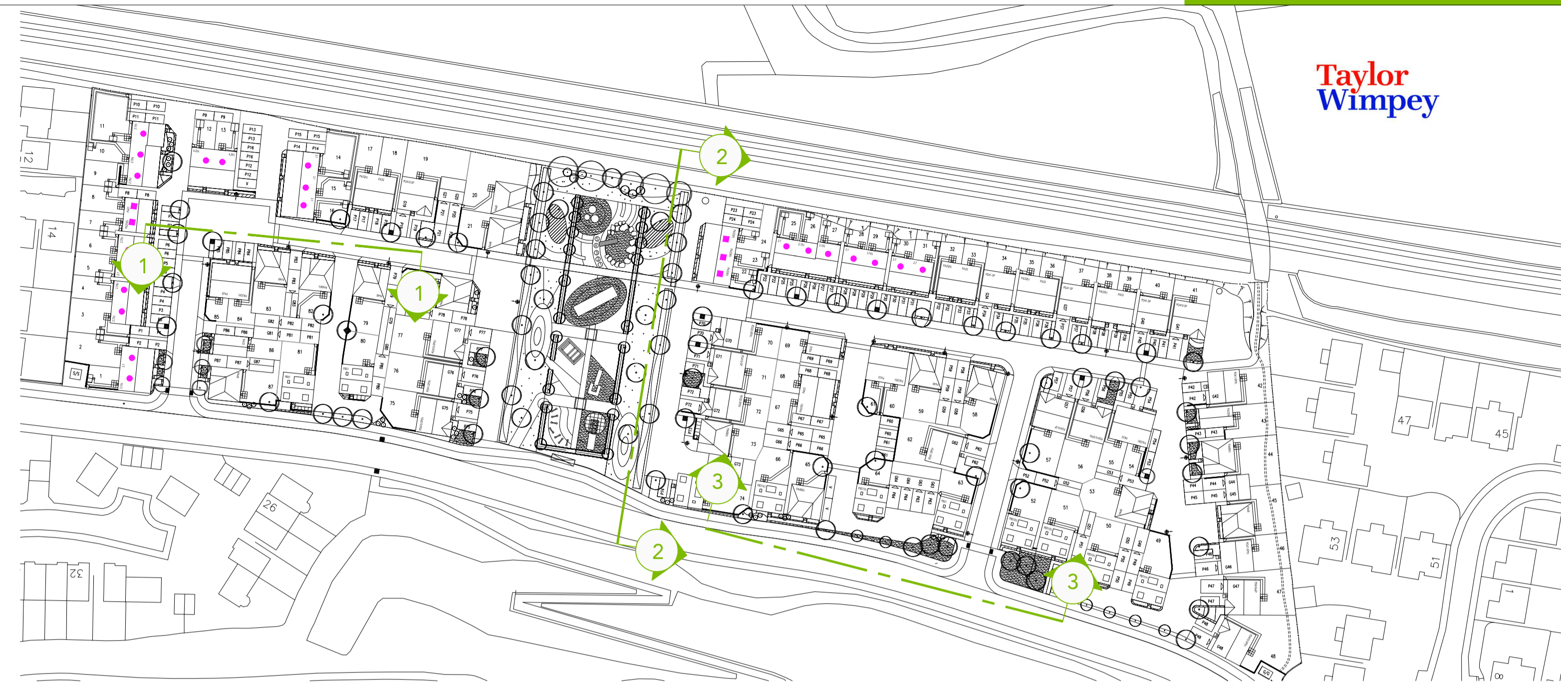
KEY PLAN 1:1000

THE VALE OF GLAMORGAN COUNCIL TOWN AND COUNTRY PLANNING ACT 1990 APPROVED SUBJECT TO COMPLIANCE WITH CONDITIONS (IF ANY)