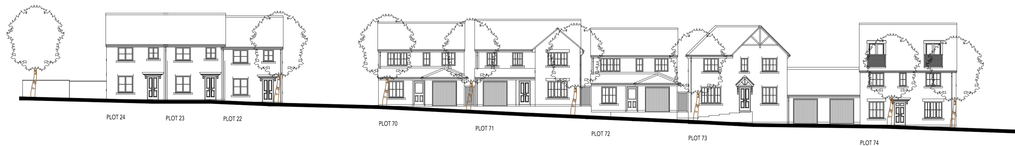
STREET SCENE 2

REVISION/S: A. 2013-03-21. Drawing updated to accord with latest layout amendments. PVA