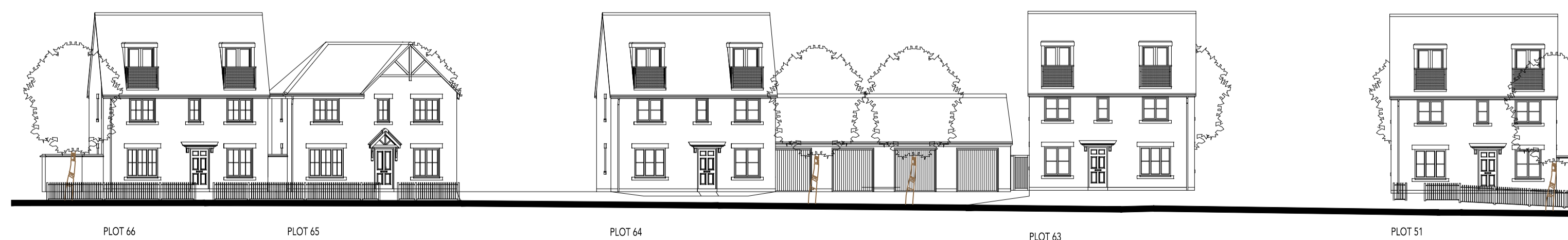
STREET SCENE 3