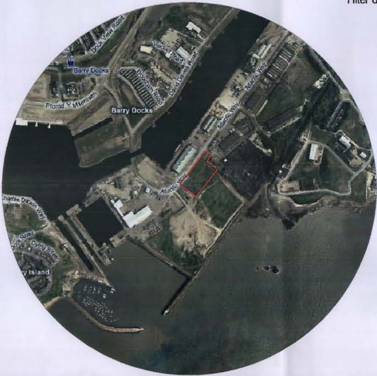
Key Site Location Plan 1:10000

NB: DRAWING FOR DISCUSSION/INFORMATION PURPOSES ONLY. SUBJECT TO ALL SURVEYS, L.A. APPROVAL AND STATUTORY AUTHORITY SERVICES INFORMATION. SUBJECT TO FIRE OFFICERS COMMENTS. SUBJECT TO FURTHER DETAIL, CLIENT APPROVAL AND MANUFACTURERS DETAILS