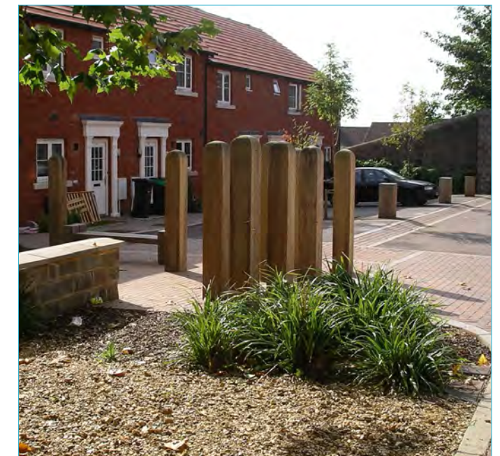
Indicative informal streetscape feature for Residential Courts

NICHOLAS PEARSON ASSOCIATES ENVIRONMENTAL PLANNERS • LANDSCAPE ARCHITECTS • ECOLOGISTS