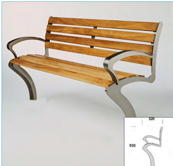
3 Seater Bench