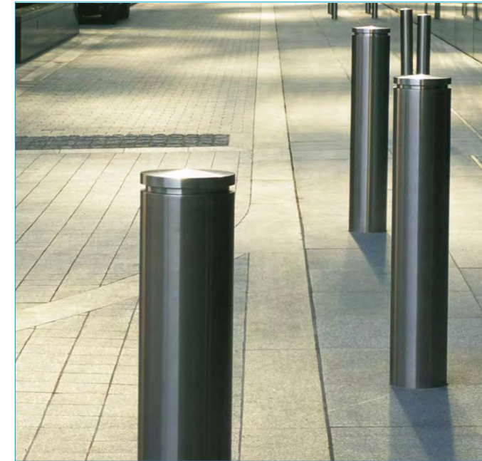
Stainless Steel Bollard