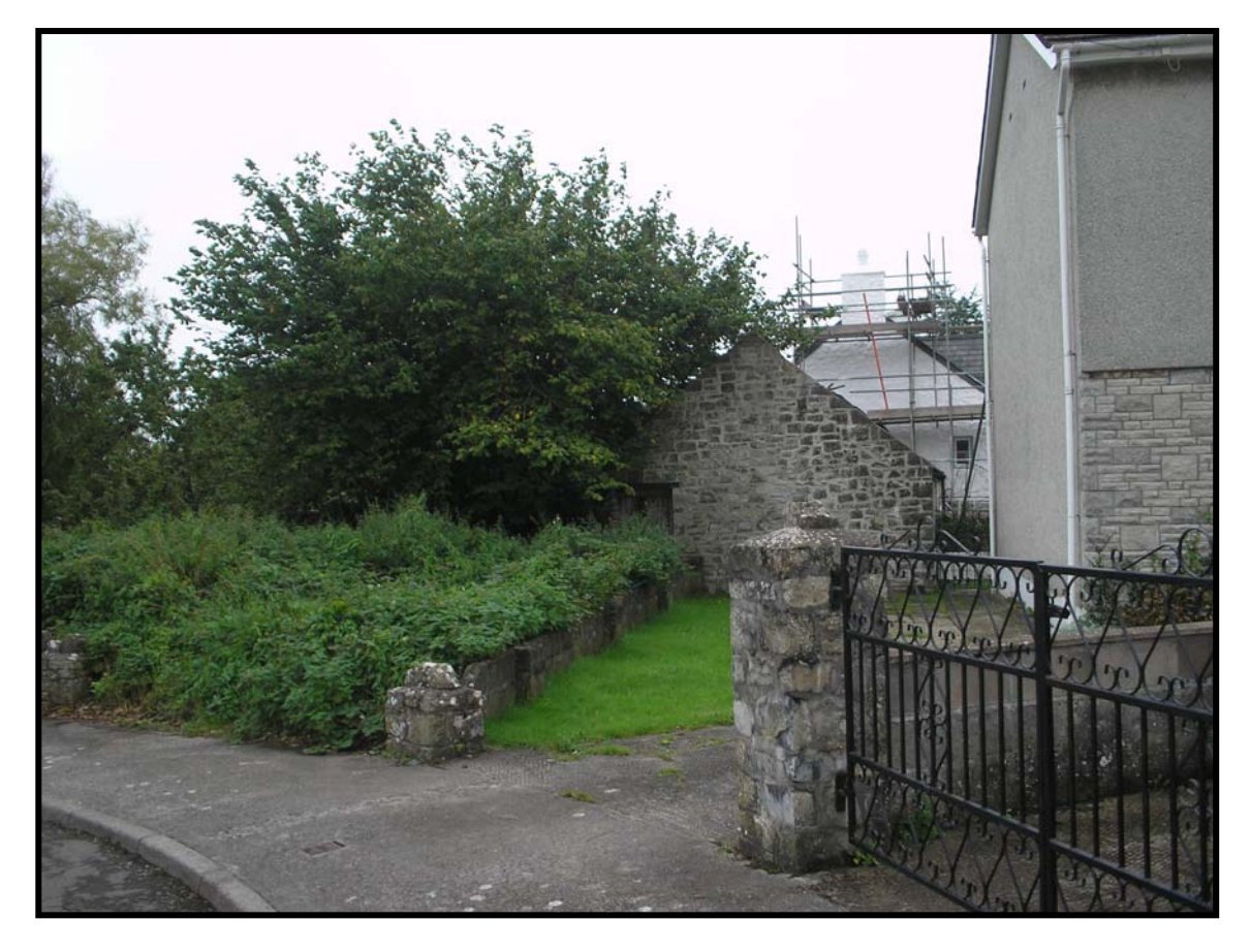
Photo No. 1: Appeal site showing proximity to gable end of Grade II listed Swimbridge Farmhouse