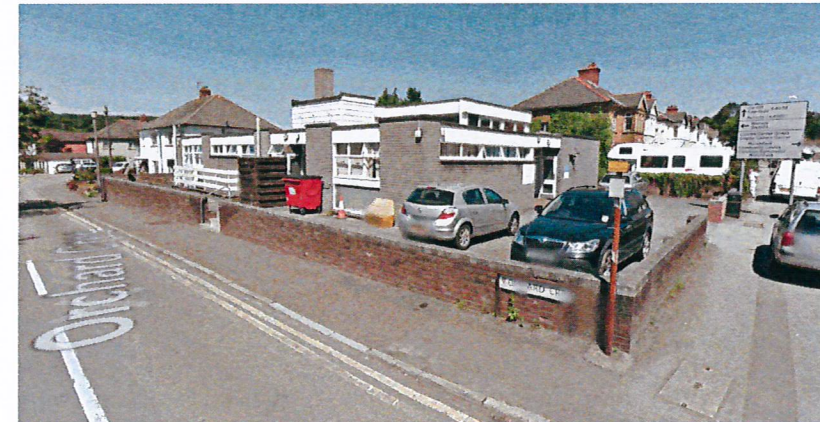
View from junction of Orchard Cres looking north