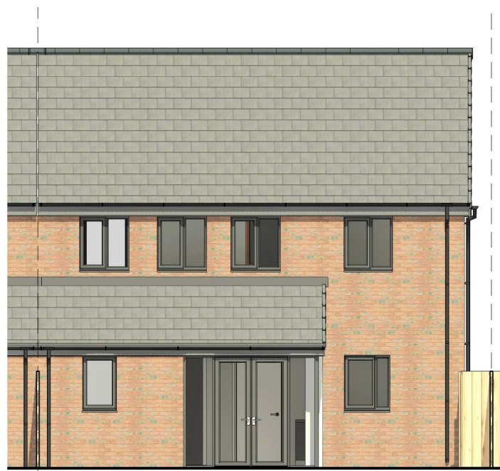
03 EXISTING REAR ELEVATION 1 : 100