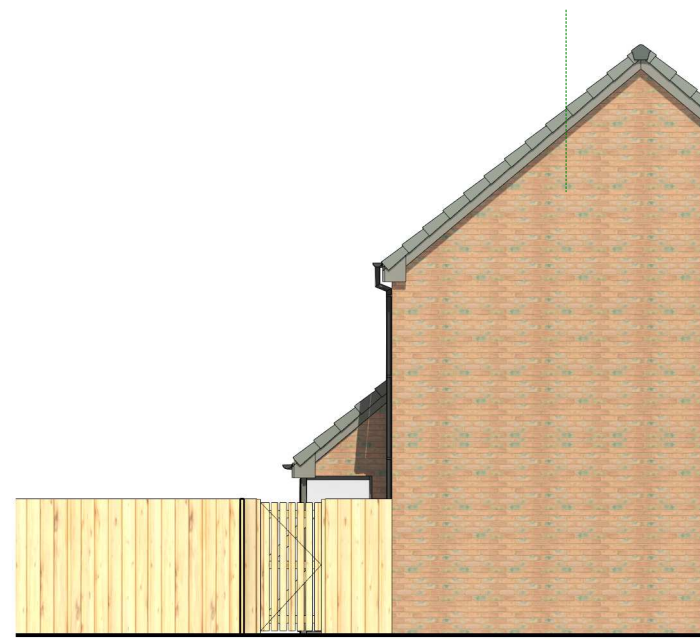
04 EXISTING SIDE ELEVATION 1 : 100