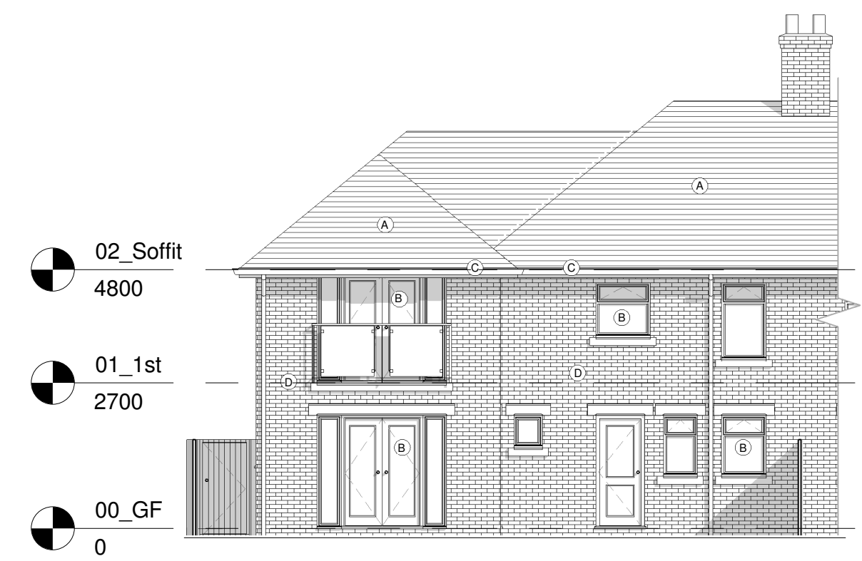
South (Rear) Elevation 1 : 100

FINISHES KEY: A : GREY SLATE ROOFING & RED RIDGE TILES B : WHITE DOUBLE GLAZED UPVC WINDOWS & DOORS C : WHITE UPVC RAINWATER GOODS AND FASCIA D : BROWN BRICKWORK EXTERNAL WALLS WITH CONCRETE WINDOW HEADS & CILLS