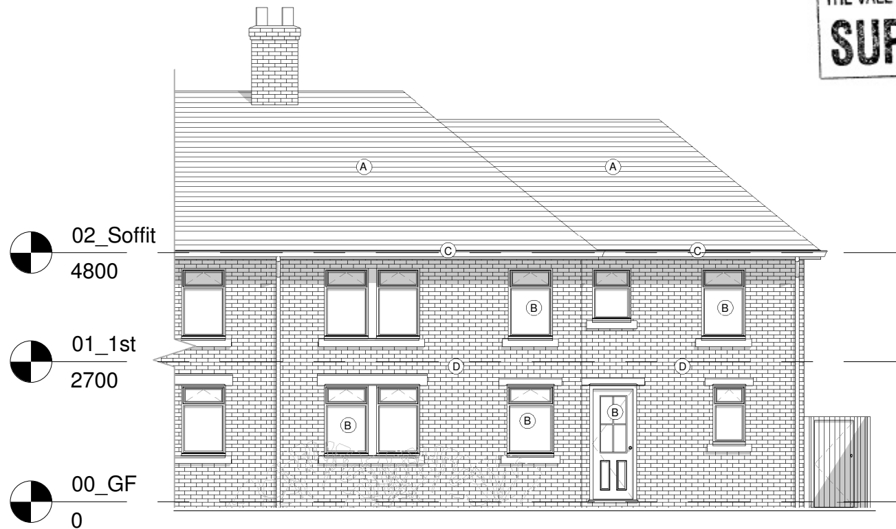
North (Front) Elevation 1 : 100

THE VALE OF GLAMORGAN COUNCIL SUPERSEDED