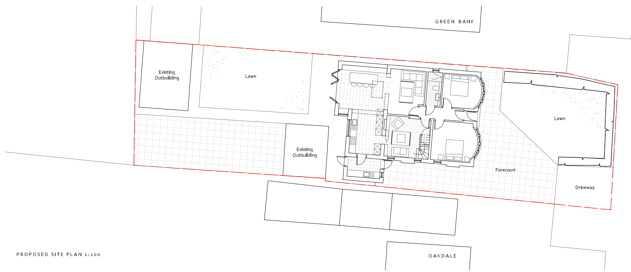
PROPOSED SITE PLAN 1:200