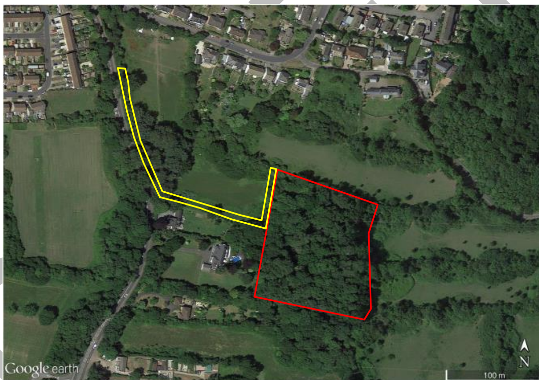
Figure 3 – Proposed modification of existing habitats for proposed future housing development (hedge modifications outlined yellow; management to Shortlands Wood outlined red)

The necessity for any additional habitat management will be determined once the proposed mitigation has developed and in line with further conservation guidelines / new advice.