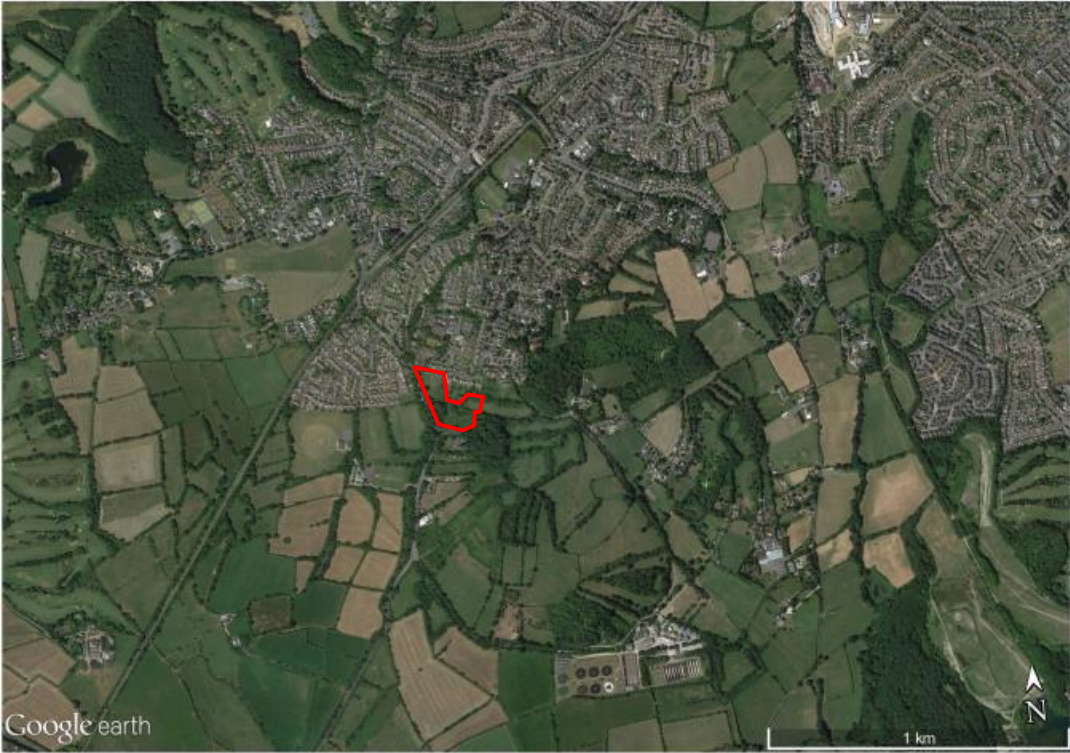
Figure 2 - Aerial view of the overall development site with the area of the housing development highlighted yellow.