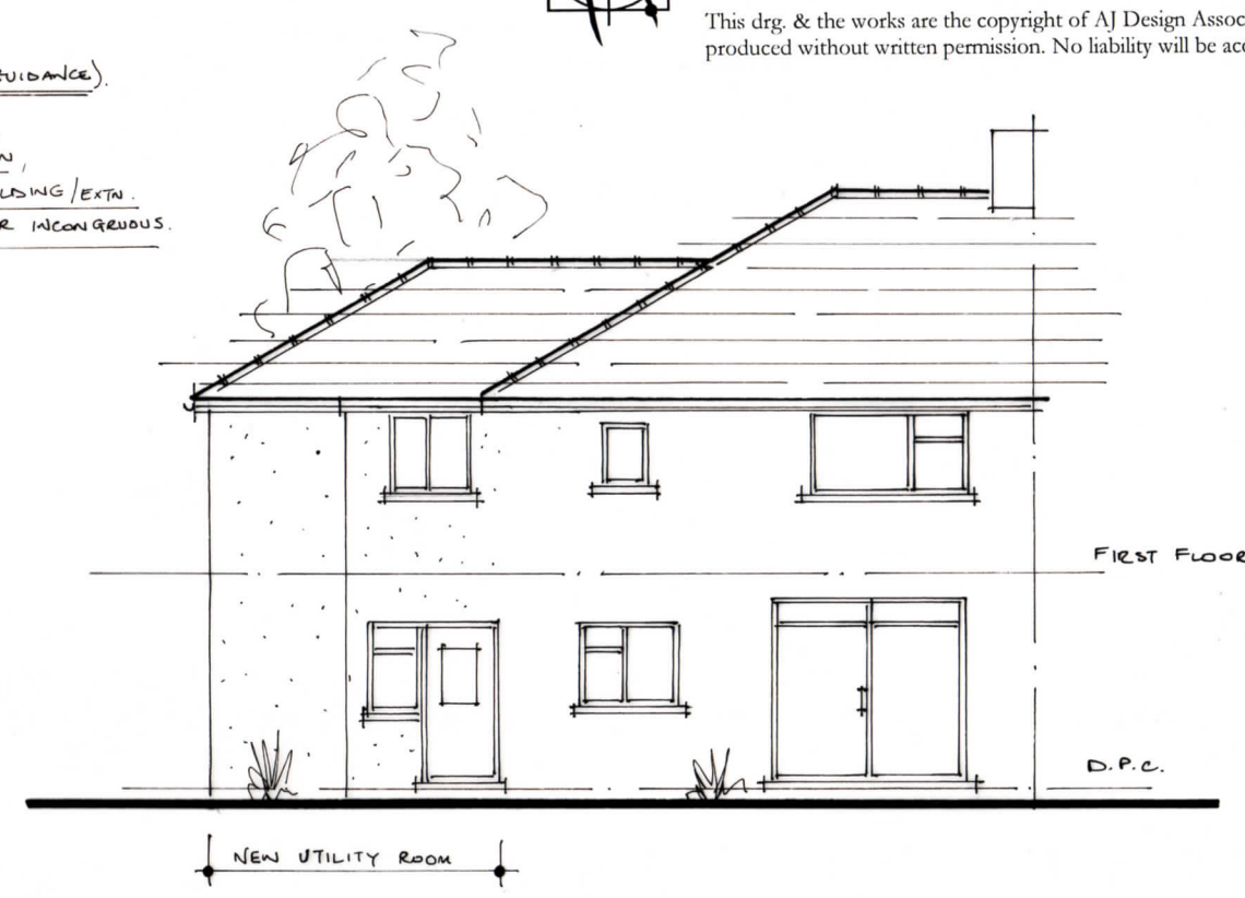
REAR ELEVATION South / West