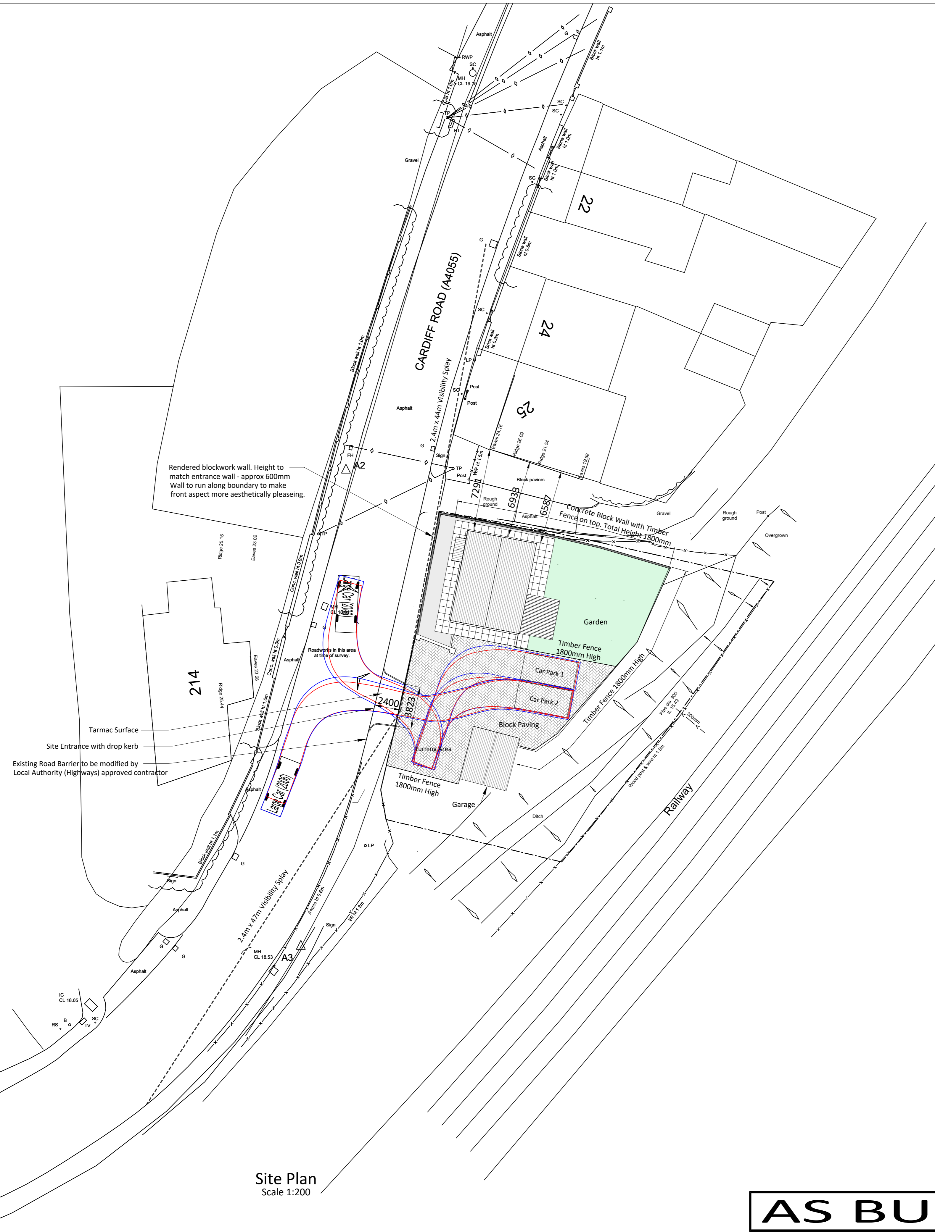
Site Plan Scale 1:200