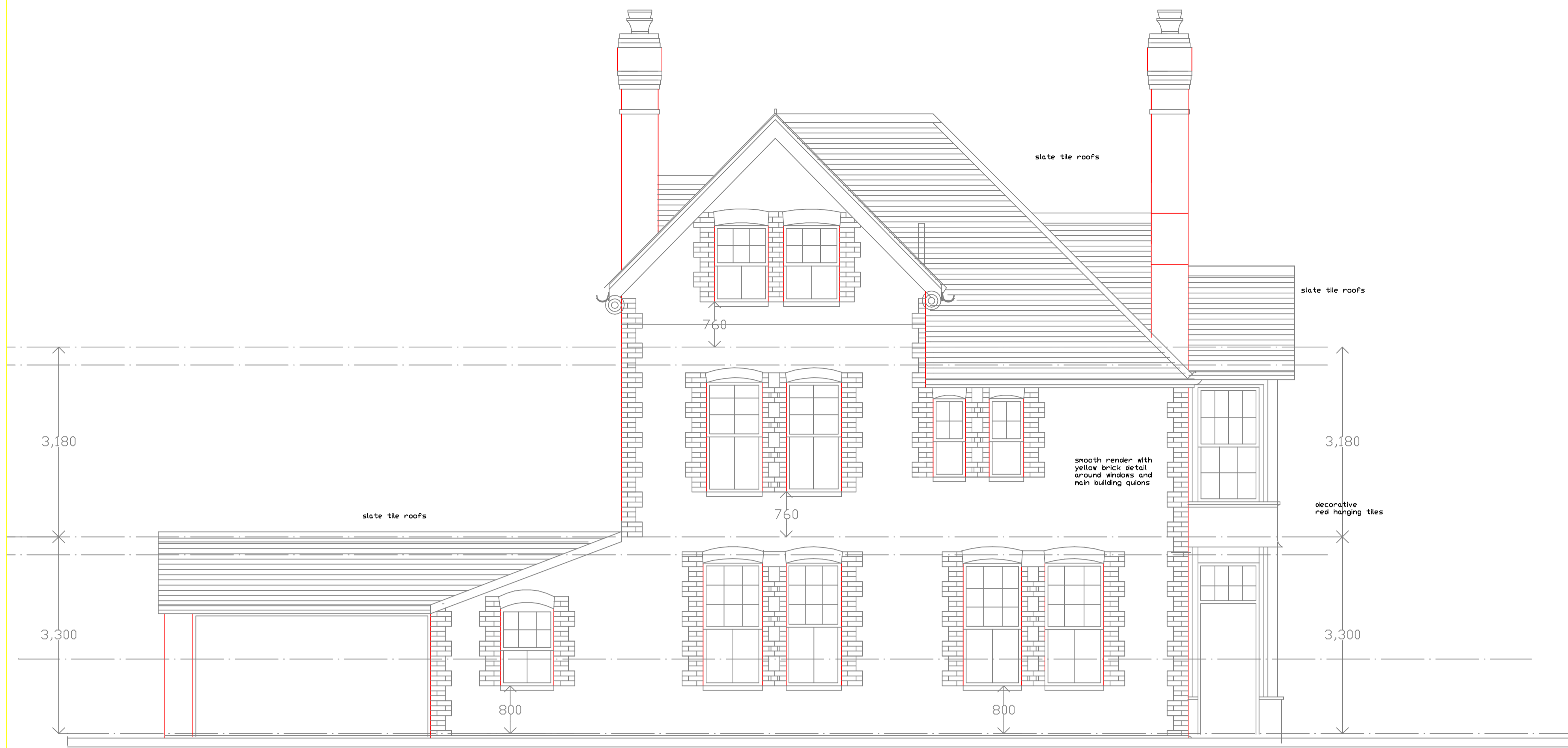
Existing Elevation to Road

Any surveyed information incorporated within this drawing cannot be guaranteed as accurate unless confirmed by fixed dimension.