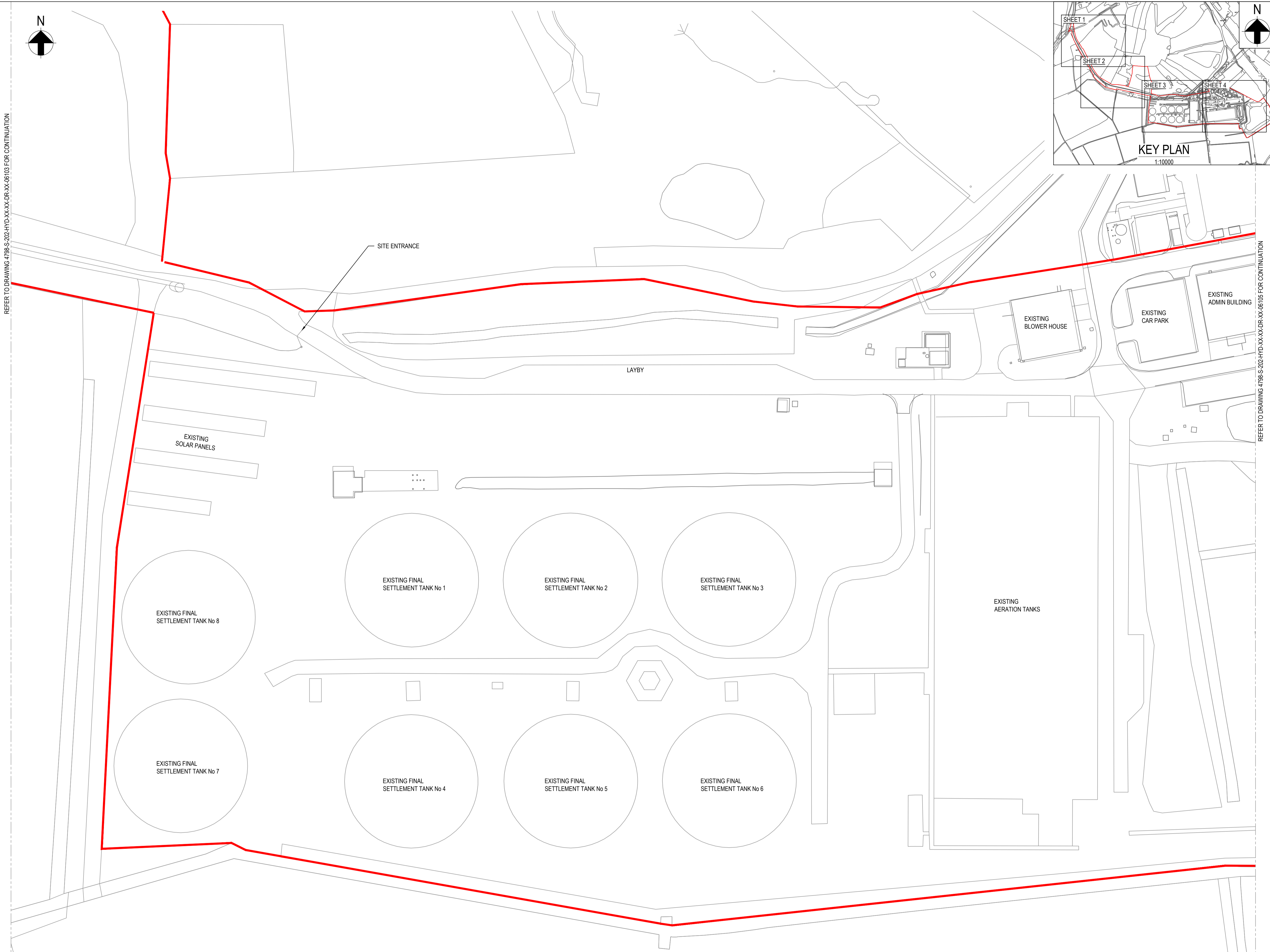
EXISTING SITE LAYOUT PLAN SCALE 1:500

REFER TO DRAWING 4798-S-202-HYD-XX-XX-DR-XX-06105 FOR CONTINUATION