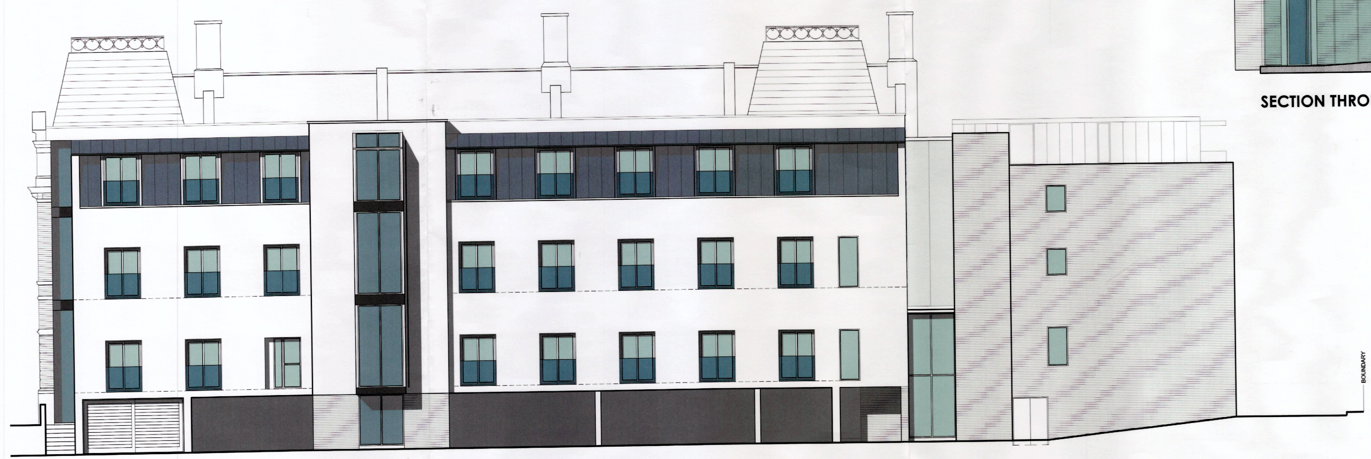
REAR ( SOUTH ) ELEVATION

VALE OF GLAMORGAN COUNCIL AMENDED PLANS 2011/01171/FULL RECEIVED Date...22/3/12