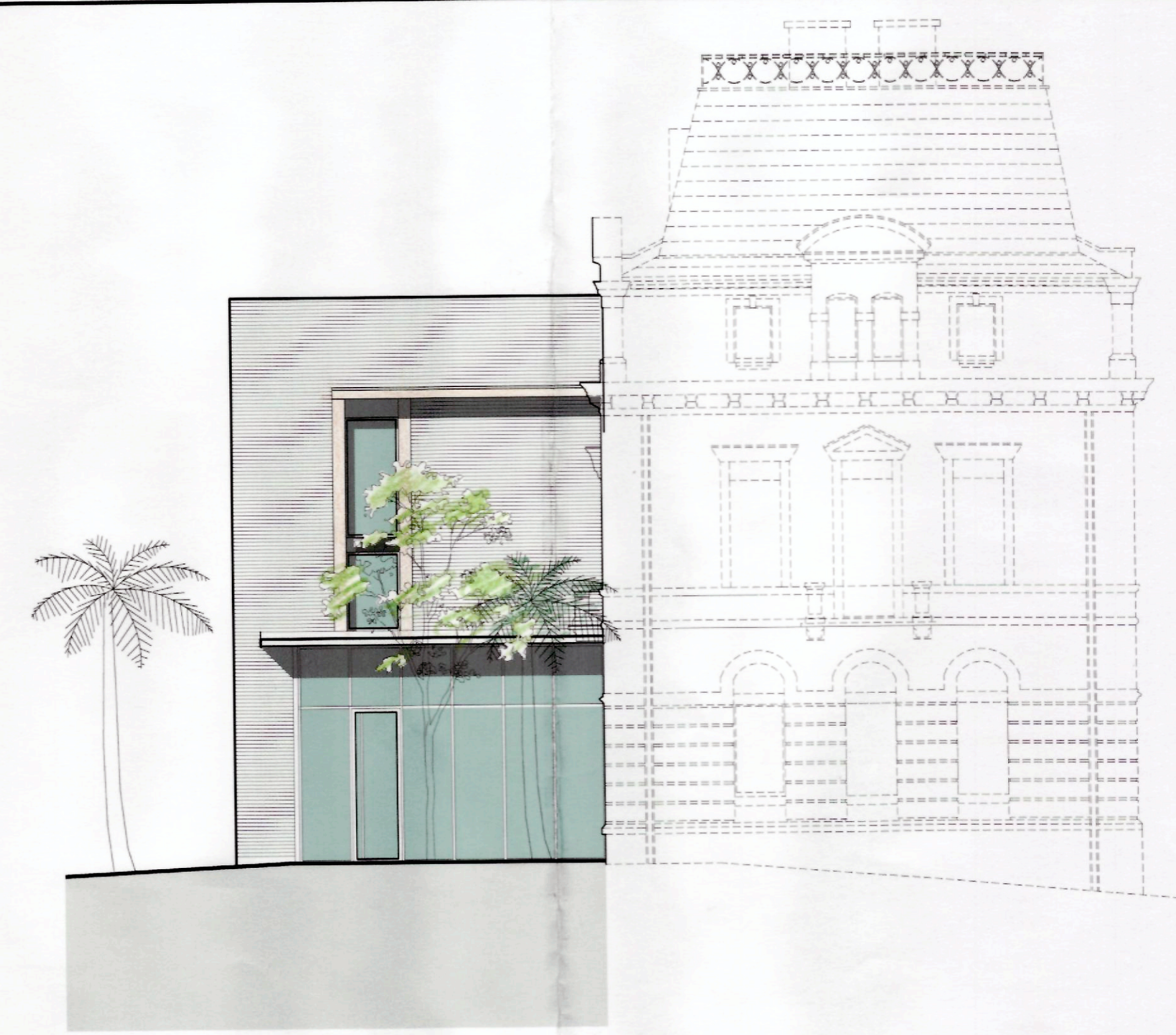
EXTENSION - WEST ELEV

THE VALE OF GLAMORGAN COUNCIL (PLANNING DIVISION) RE-REGISTERED HEAD OF PLANNING AND TRANSPORTATION